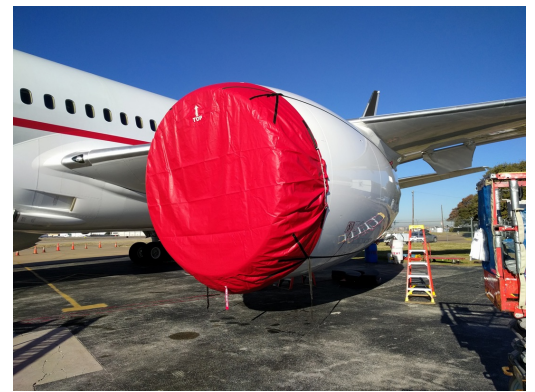
Boeing 787 Intake Cover