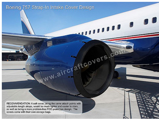
Boeing 757 RB.211 Intake Covers, using existing pit pin locations