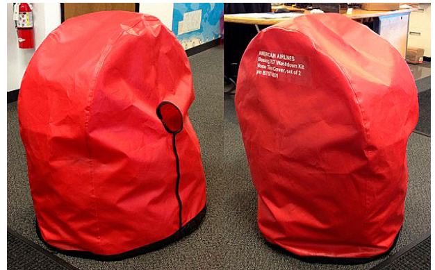
Boeing 757 Tire Covers, great for Wash Prep or Storage