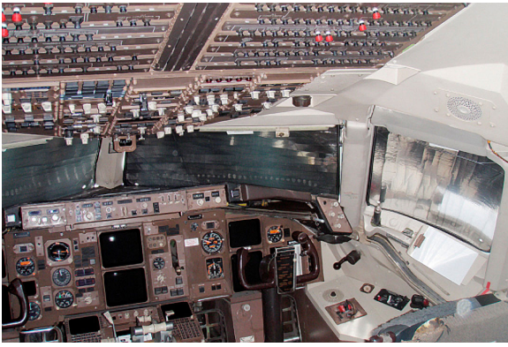
Boeing 757 Cockpit HeatShield set