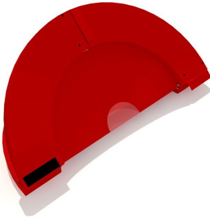
Airbus A330 Intake Plug, framed bi-fold type