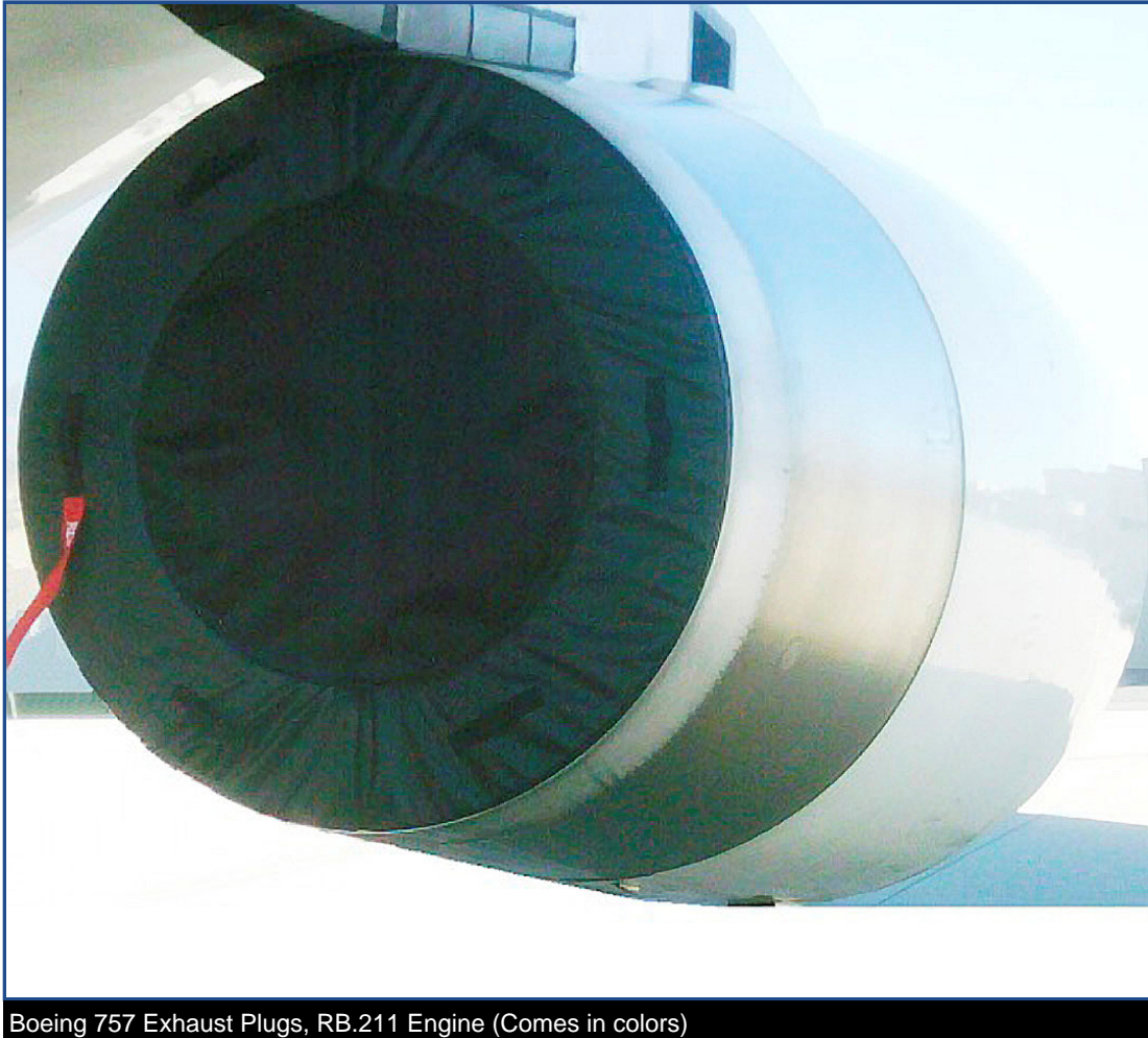
Boeing 757 Exhaust Plugs, RB.211 Engine (Comes in colors)