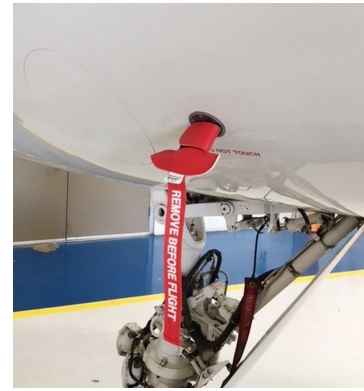
Grumman Gulfstream G-V Rosemont/TAT Cover