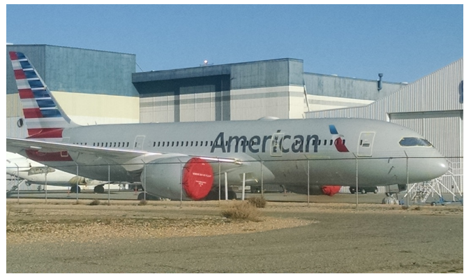
Boeing 787 Intake Covers