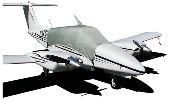
Duchess Standard Canopy Cover