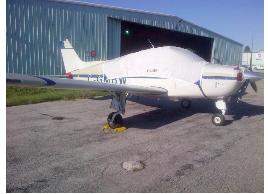
Beech Sierra Canopy Cover, Engine Plugs, Tailcone Cover