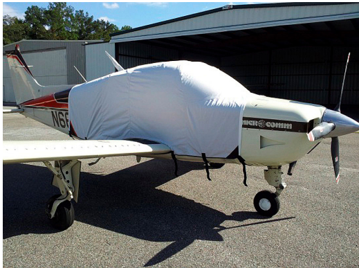
Beech Sport Extended Canopy Cover