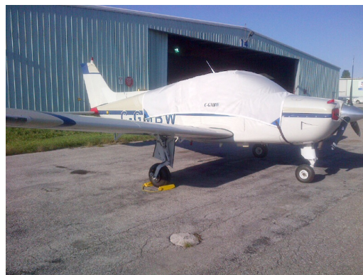
Beech Sierra Canopy Cover, Engine Plugs, Tailcone Cover