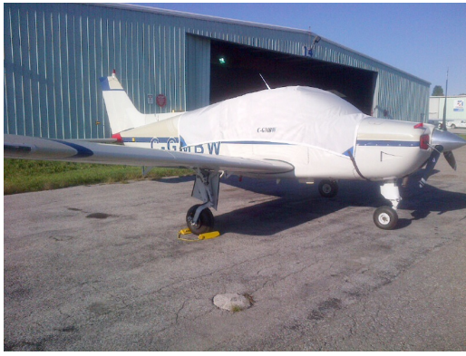
Beech Sierra Canopy Cover, Engine Plugs, Tailcone Cover