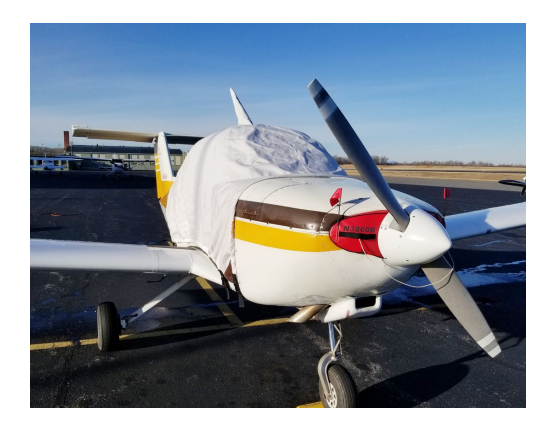
Beech Skipper Extended Canopy Cover and Inlet Plugs