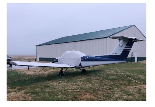
Beech Skipper Extended Canopy Cover, Wing & Horiz. Stab. Covers

WINTER USE MATERIAL - Made with Solution-Dyed Polyester fabric, this option is intended for seasonal use to aid in deicing, rain mitigation, or for occasional travel. The material is lighter and more compact, but more susceptible to UV damage and may have a shorter useful life if used continuously outside than the all-year use material.