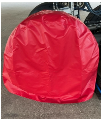
Boeing 777 Main Gear Tire Covers

ALL-YEAR USE MATERIAL - Made with Silver Acrylic Sunbrella canvas, the all-year use material is the best option for sun protection and cover longevity. This heavier more durable material is intended for all weather conditions, such as rain and snow or lots of sun.