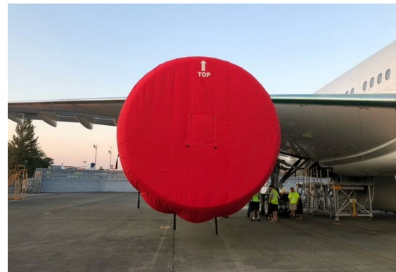
Boeing 777 Intake Covers, GE9X Engine