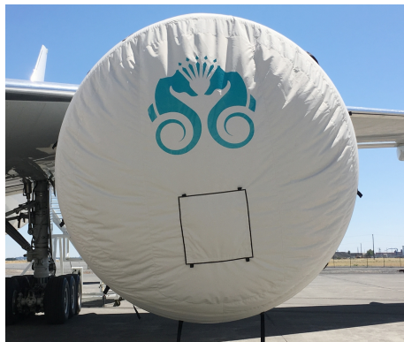
Boeing 777 Intake Covers, GE Engine