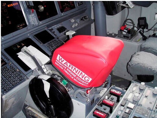
Boeing 737 Throttle Quadrant Cover