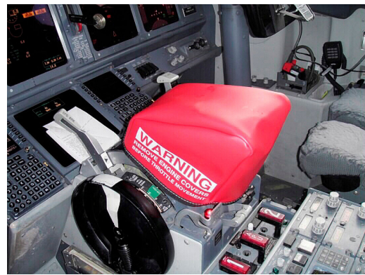
Boeing 737 Throttle Quadrant Cover