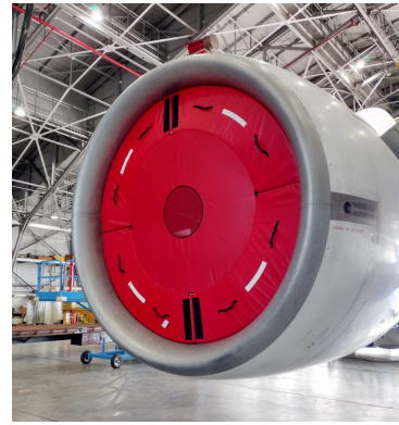
Boeing 777 Intake Plugs, Folding Type