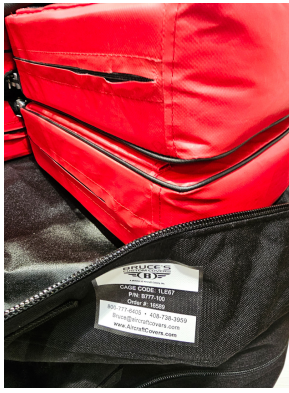
Boeing 777 Intake Plugs, Framed, Bi-Fold Design