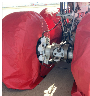
Boeing 777 Main Gear Tire Covers