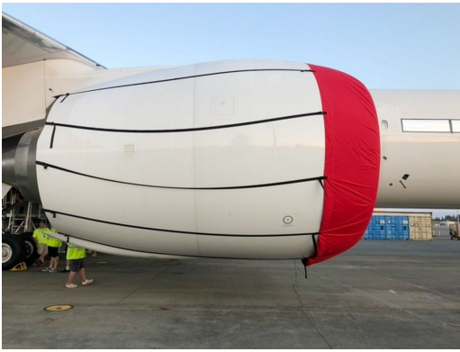
Boeing 777 Intake Covers, GE9X Engine