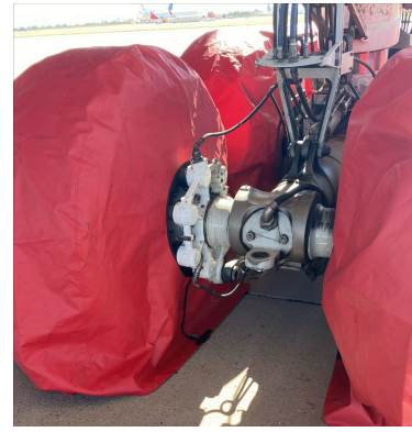
Boeing 777 Main Gear Tire Covers