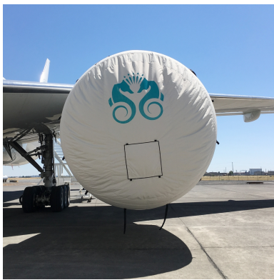
Boeing 777 Intake Covers, GE Engine