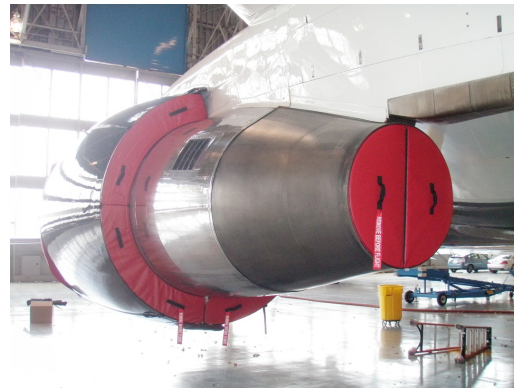
Boeing 777 Intake Plugs, Folding Type Exhaust Plugs Ship Set, incl. Fan Thrust Reverser and Exhaust Plugs P/N: B767-200