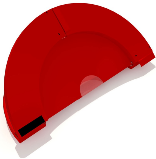
Airbus A330 Intake Plug, framed bi-fold type

The Engine Exhaust Plugs are custom fit for your Boeing 787 Dreamliner exhaust openings, made with heavy-duty vinyl material, and stuffed with a single block of sculpted urethane foam. Each plug has a zipper that allows the foam to be removed and dried if necessary. Exhaust plugs have 'remove before flight' streamers sewn onto the face of the plugs. Most plugs are imprinted with the aircraft registration number in black for an extra charge. Exhaust plugs may be inserted soon after flight when the engine is still warm. Engine Inlet Plugs are commonly referred to as Cowl Plugs, Intake Plugs, Cowl Blocks, Engine Blocks, and Engine Bungs.