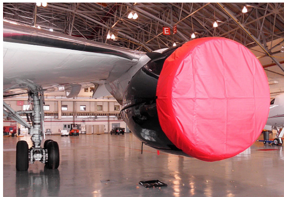
Boeing 767 Intake Covers, P/N: B767-105