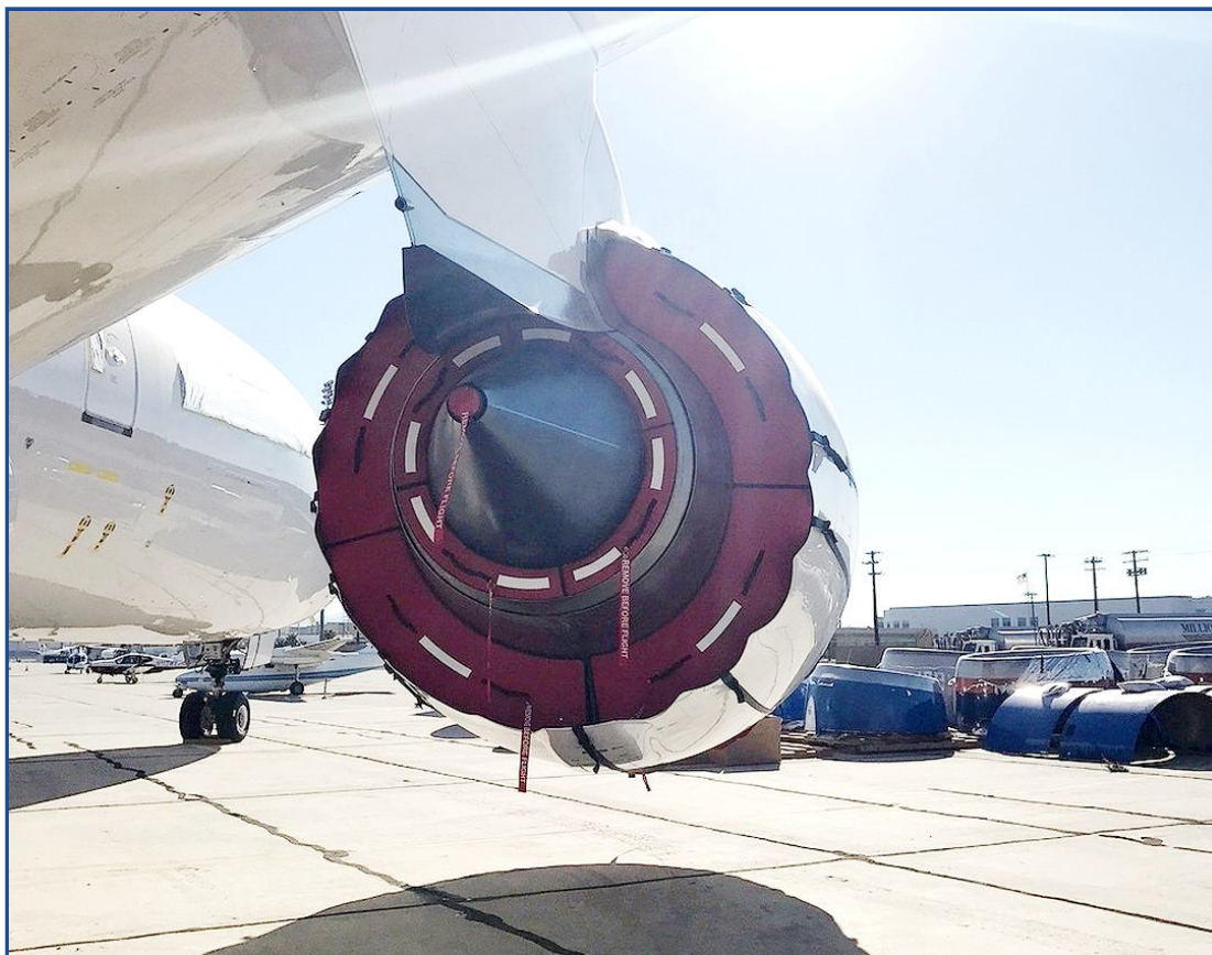
Boeing 787 Dreamliner Bypass Vent, Turbine Exhaust, & Exhaust Nozzle Plugs, Genx Engines