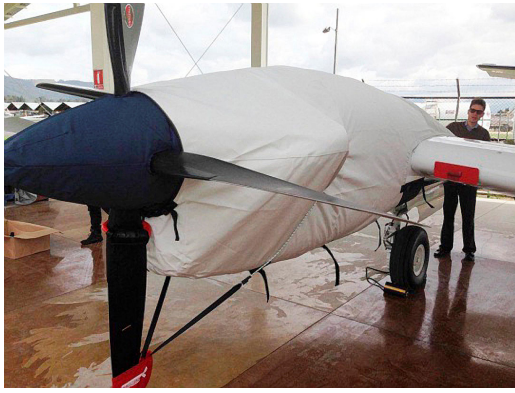
King Air C90 Engine Cover