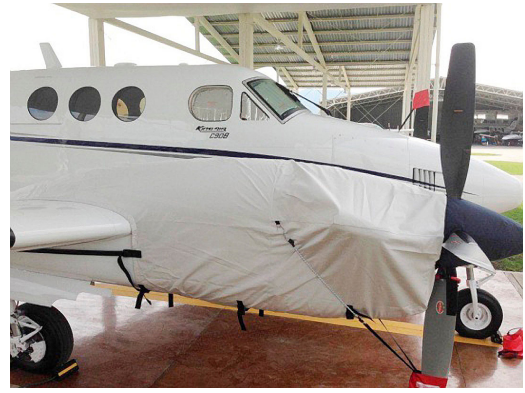
King Air C90 Engine Cover