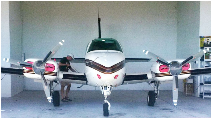
Beech Baron 58 Engine Inlet Plugs, Heater Inlet Plugs

Engine Inlet Plugs are custom fit for your Beech Travel Air B95 intakes, made with heavy-duty vinyl material, and stuffed with a single block of sculpted urethane foam. Each plug has a zipper that allows the foam to be removed and dried if necessary. Engine plugs have warning flags that are visible from the cockpit or 'remove before flight' streamers sewn onto the face of the plugs. Most plugs are imprinted with the aircraft registration number in black for an extra charge. Storage bag NOT included. Engine plugs may be inserted after flight when the engine is still warm. Engine Inlet Plugs are commonly referred to as Cowl Plugs, Intake Plugs, Cowl Blocks, Engine Blocks, and Engine Bungs.