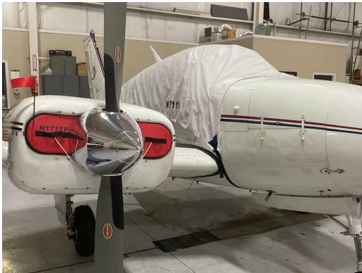
Beech Travel Air Engine Plugs