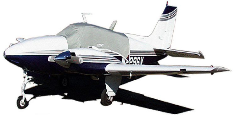
Beech Baron Canopy Cover