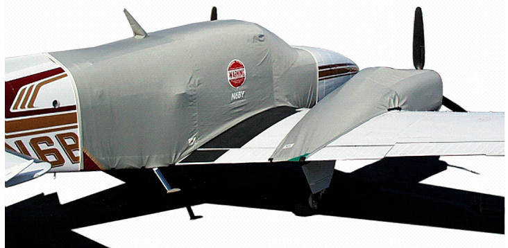
Baron Extended Canopy Cover & Engine Covers