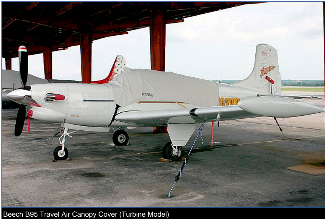
Beech B95 Travel Air Canopy Cover (Turbine Model)