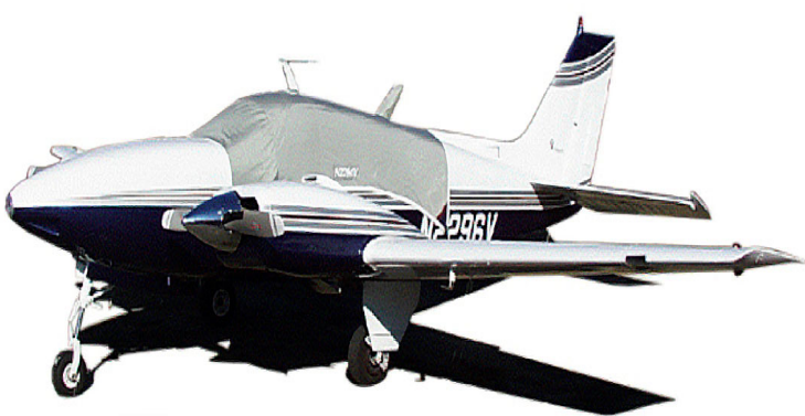
Beech Baron Canopy Cover

Canopy Covers are commonly referred to as Cabin Covers, Fuselage Covers, Canvas Covers, Canopy Caps, etc.