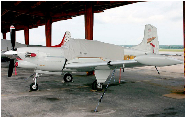
Beech B95 Travel Air Canopy Cover (Turbine Model)