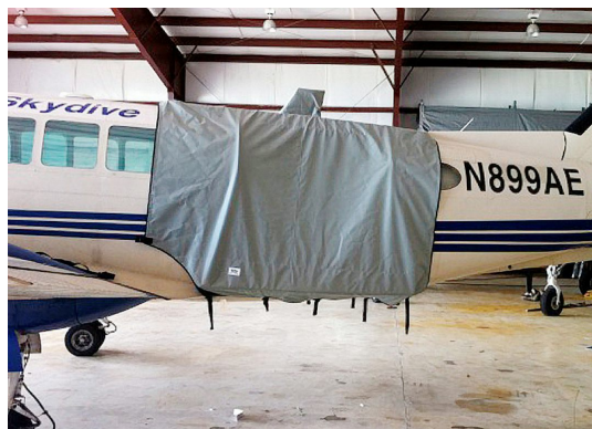
750XL Jump Door Cover