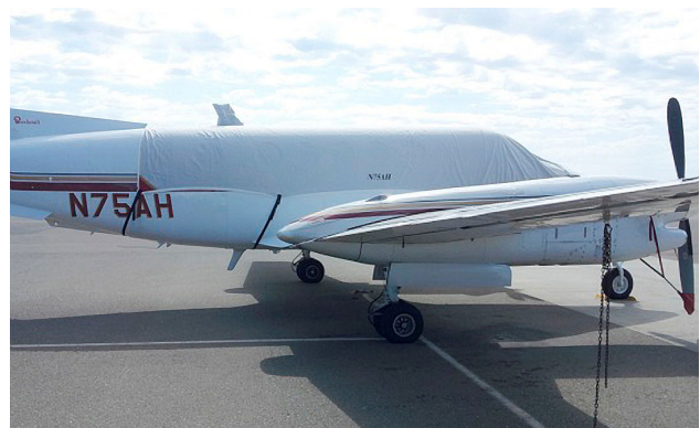
King Air 350 Canopy Cover