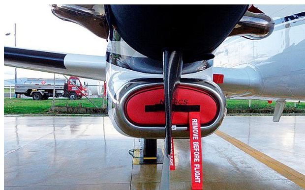
Beech King Air C90B Main Engine Inlet Plug