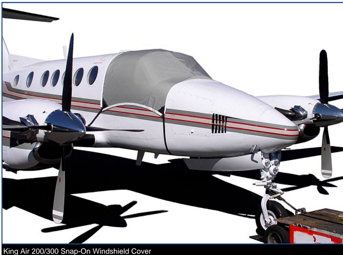
King Air 200/300 Snap-On Windshield Cover