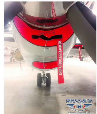
Engine and Oil Cooler Inlet Plugs