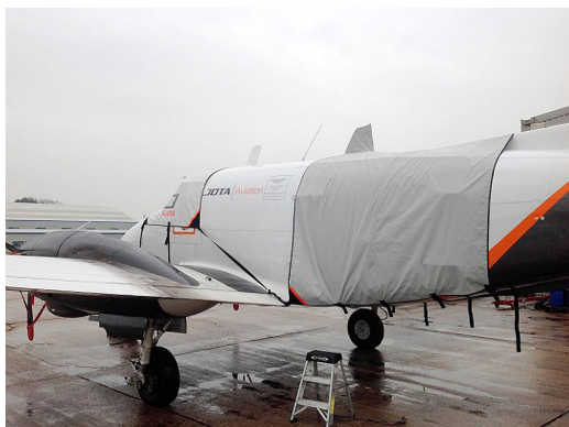
King Air Cargo/Jump Door Rain Cover