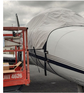
British Aerospace Jetstream 31 Cockpit Cover