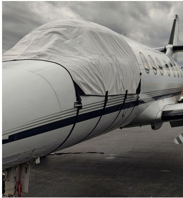
British Aerospace Jetstream 31 Cockpit Cover

This cover type is made from Silver Acrylic Sunbrella canvas and is 100% lined with a soft and smooth microfiber. Bruce's Custom Covers developed this material combination especially for aircraft protection. The outer material is medium weight and treated for water resistance, UV resistance and anti-static buildup. The inner lining is a very soft and smooth microfiber to prevent scratching. The material is very reflective, and tests show that the cabin interior temperature can be reduced to near-ambient temperature on the hottest of days. It is water, ice and snow repellent, yet breathable to allow moisture to escape from between the cover and the aircraft surface.