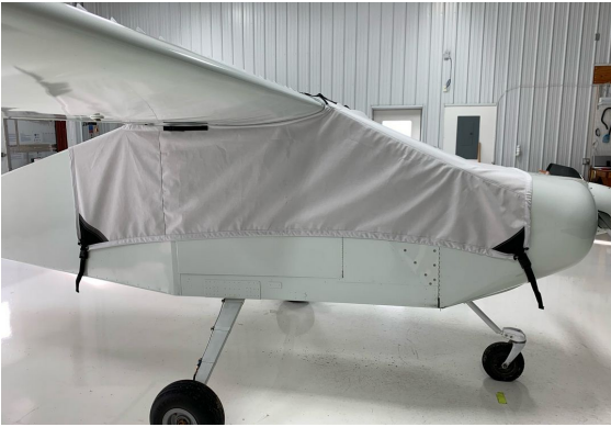
Bede BD-4 Canopy Cover

water resistance, UV resistance and anti-static buildup. The inner lining is a very soft and smooth microfiber to prevent scratching. The material is very reflective, and tests show that the cabin interior temperature can be reduced to near-ambient temperature on the hottest of days. It is water, ice and snow repellent, yet breathable to allow moisture to escape from between the cover and the aircraft surface.