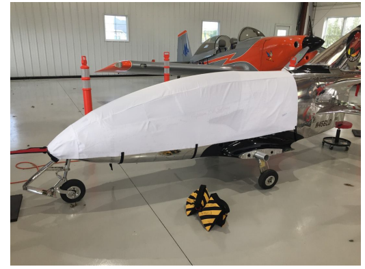
Bede BD-5 Canopy/Nose Cover, test fit cover