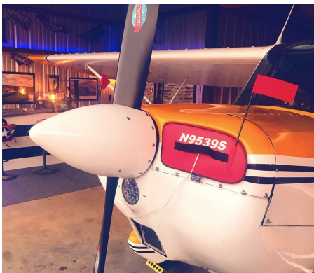
Bellanca Citabria Engine Plugs

Engine Inlet Plugs are custom fit for your Bellanca (American Champion) Decathlon intakes, made with heavy-duty vinyl material, and stuffed with a single block of sculpted urethane foam. Each plug has a zipper that allows the foam to be removed and dried if necessary. Engine plugs have warning flags that are visible from the cockpit or 'remove before flight' streamers sewn onto the face of the plugs. Most plugs are imprinted with the aircraft registration number in black for an extra charge. Storage bag NOT included. Engine plugs may be inserted after flight when the engine is still warm. Engine Inlet Plugs are commonly referred to as Cowl Plugs, Intake Plugs, Cowl Blocks, Engine Blocks, and Engine Bungs.