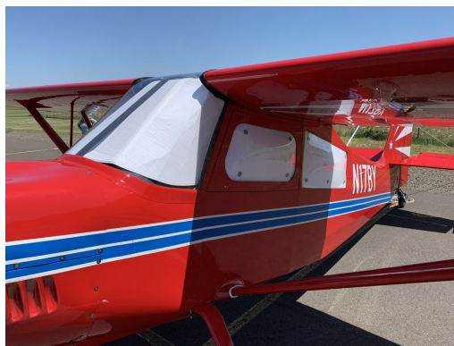
Bellanca Decathlon 8KCAB Heatshield Set with white side out