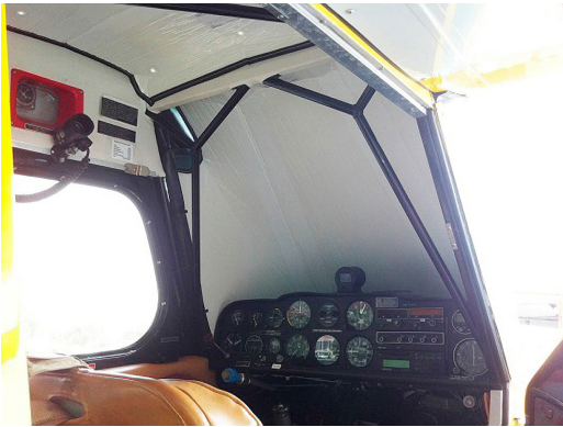
Bellanca Citabria Windshield & Skylight HeatShields

Windshield Heatshields are interior sunshades for an aircraft's front windshield. The product is a unique composite of closed-cell foam with a silver mylar finish. The semi-rigid design is stiff enough to stand along the inside of the windshield using sun visors or window framing. It folds up flat and easily stores in the included storage sleeve. Some designs may require velcro and suction cups or split right and left sides. A Heatshield is an excellent short-term remedy for cockpit overheating. An external fabric cover is far more effective and practical for long-term protection.