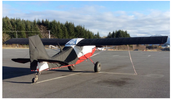
Bellanca Scout 8GCBC Canopy, Wing & Empennage Covers