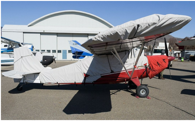
Bellanca Citabria 7ECA Canopy, Empennage & Wing Covers