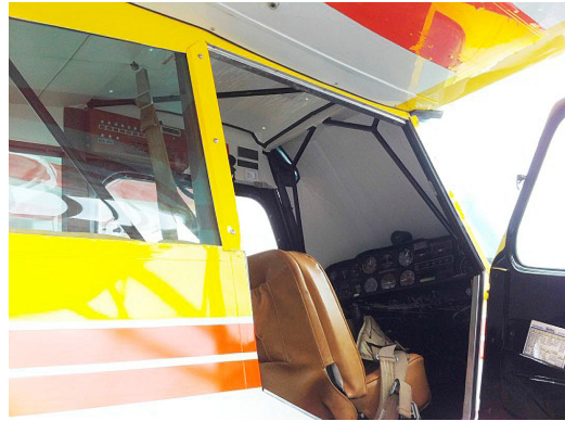
Bellanca Citabria Windshield & Skylight HeatShields