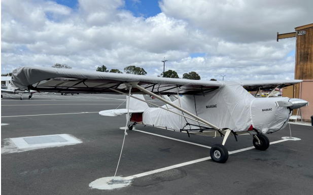
Bellanca Decathlon Full Cover Set

WINTER USE MATERIAL - Made with Solution-Dyed Polyester fabric, this option is intended for seasonal use to aid in deicing, rain mitigation, or for occasional travel. The material is lighter and more compact, but more susceptible to UV damage and may have a shorter useful life if used continuously outside than the all-year use material.