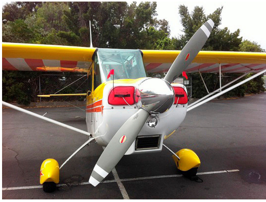
Bellanca Citabria Engine Plugs