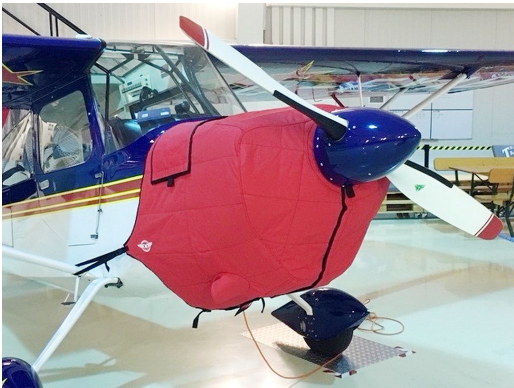
Bellanca Citabria Insulated Engine Cover (single exhaust)

This cover type is made from Silver Acrylic Sunbrella canvas and is 100% lined with a soft and smooth microfiber. Bruce's Custom Covers developed this material combination especially for aircraft protection. The outer material is medium weight and treated for water resistance, UV resistance and anti-static buildup. The inner lining is a very soft and smooth microfiber to prevent scratching. The material is very reflective, and tests show that the cabin interior temperature can be reduced to near-ambient temperature on the hottest of days. It is water, ice and snow repellent, yet breathable to allow moisture to escape from between the cover and the aircraft surface.