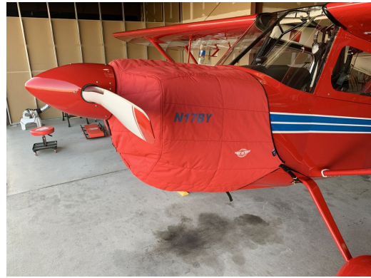
American Champion 8KCAB Insulated Engine Cover