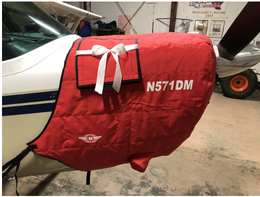
Bellanca Citabria Insulated Engine Cover

This cover type is made from Silver Acrylic Sunbrella canvas and is 100% lined with a soft and smooth microfiber. Bruce's Custom Covers developed this material combination especially for aircraft protection. The outer material is medium weight and treated for water resistance, UV resistance and anti-static buildup. The inner lining is a very soft and smooth microfiber to prevent scratching. The material is very reflective, and tests show that the cabin interior temperature can be reduced to near-ambient temperature on the hottest of days. It is water, ice and snow repellent, yet breathable to allow moisture to escape from between the cover and the aircraft surface.