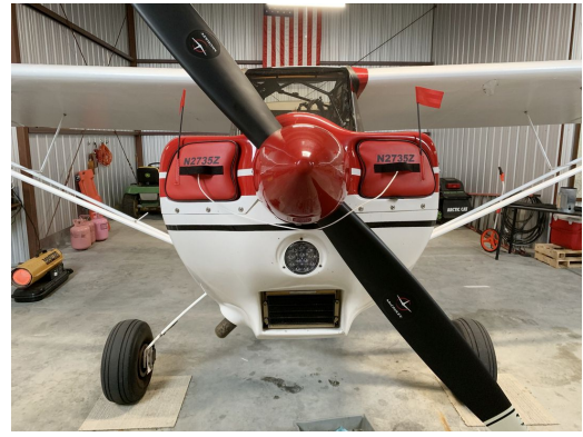
BELLANCA 7ECA Engine Inlet Plugs