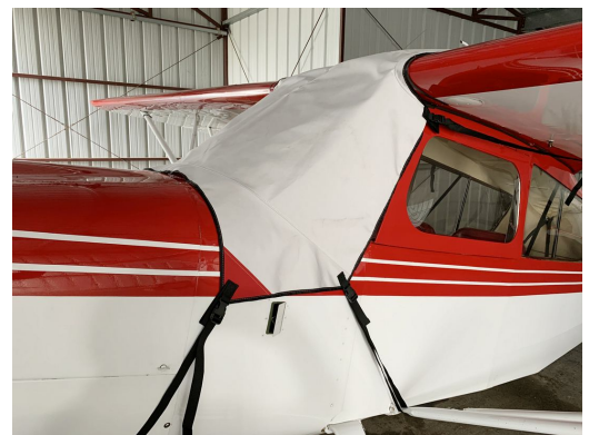
Bellanca Citabria Windshield/Skylight Cover