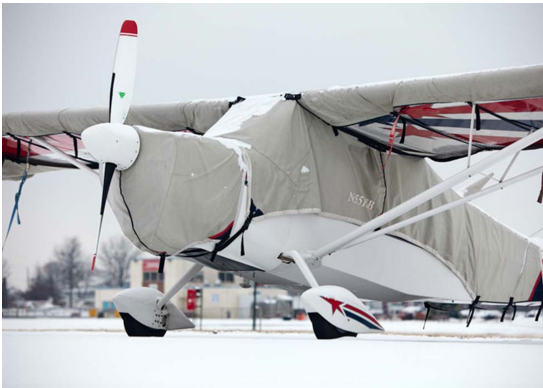
American Champion Decathlon Extended Canopy, Engine, Wing & Empennage Covers Bellanca Decathlon Canopy Cover (extended aft), Engine & Wing Covers