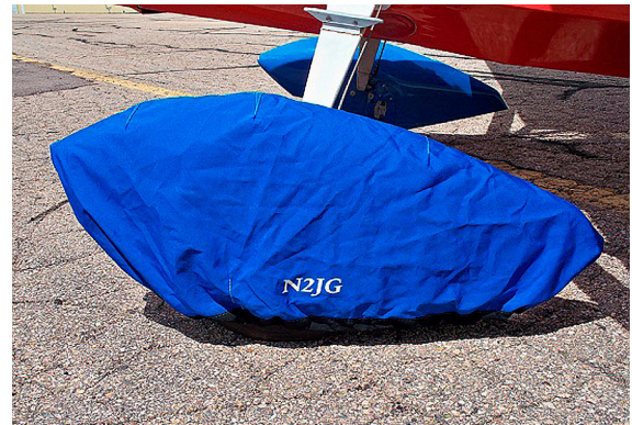
Bellanca Citabria Wheelpant Cover