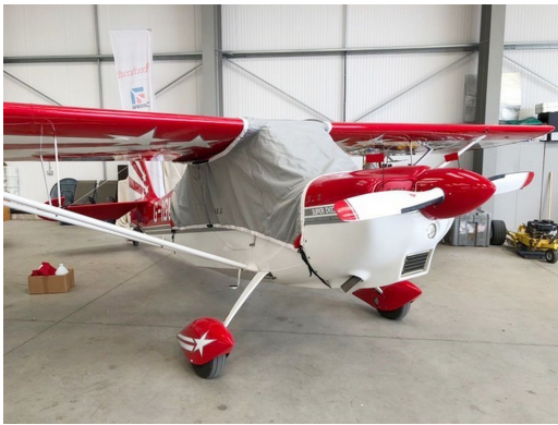
Bellanca Decathlon Travel Weight Over-Top Canopy Cover

This cover type is made from Silver Acrylic Sunbrella canvas and is 100% lined with a soft and smooth microfiber. Bruce's Custom Covers developed this material combination especially for aircraft protection. The outer material is medium weight and treated for water resistance, UV resistance and anti-static buildup. The inner lining is a very soft and smooth microfiber to prevent scratching. The material is very reflective, and tests show that the cabin interior temperature can be reduced to near-ambient temperature on the hottest of days. It is water, ice and snow repellent, yet breathable to allow moisture to escape from between the cover and the aircraft surface.