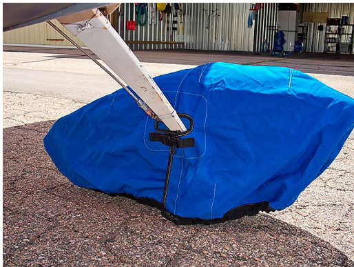
Bellanca Citabria Wheelpant Cover

ALL-YEAR USE MATERIAL - Made with Silver Acrylic Sunbrella canvas, the all-year use material is the best option for sun protection and cover longevity. This heavier more durable material is intended for all weather conditions, such as rain and snow or lots of sun.