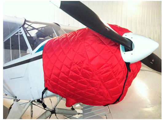
Bellanca Citabria Over-Top Canopy Cover, Extended to Tail, Engine & Wing Covers Piper Super Cub Insulated Engine Cover