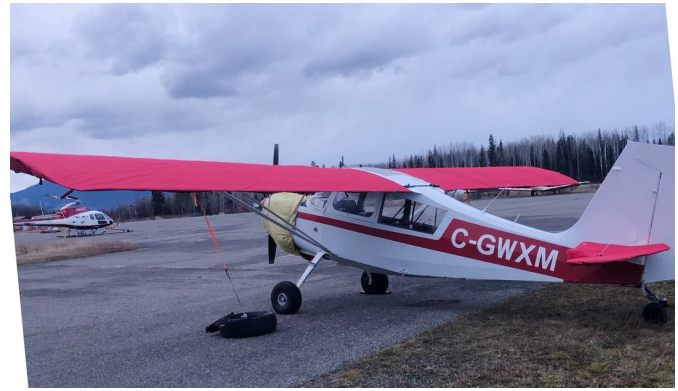
Bellanca Scout 8GCBC Wing & Horizontal Stabilizer Covers