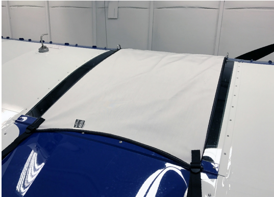
Cub Crafters CC-11 Windshield Cover

This cover type is made from Silver Acrylic Sunbrella canvas and is 100% lined with a soft and smooth microfiber. Bruce's Custom Covers developed this material combination especially for aircraft protection. The outer material is medium weight and treated for water resistance, UV resistance and anti-static buildup. The inner lining is a very soft and smooth microfiber to prevent scratching. The material is very reflective, and tests show that the cabin interior temperature can be reduced to near-ambient temperature on the hottest of days. It is water, ice and snow repellent, yet breathable to allow moisture to escape from between the cover and the aircraft surface.