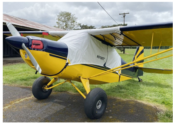
American Champion Citabria canopy cover over the top style, extends to cover gas caps, Engine Plugs