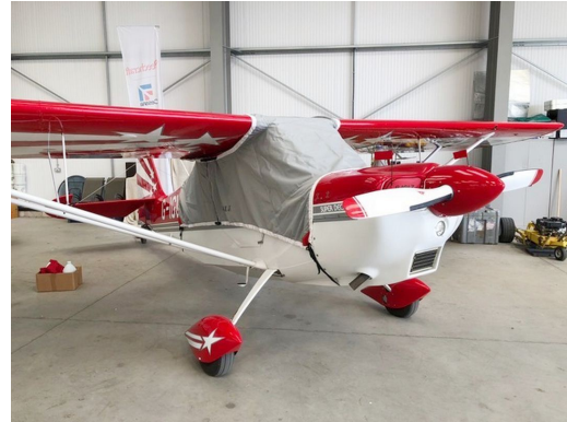
Bellanca Decathlon Travel Weight Over-Top Canopy Cover