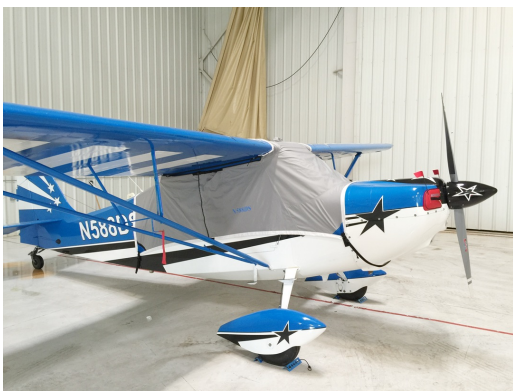
Bellanca Citabria Light Weight Travel Cover, Engine Plugs

This cover type is made from Silver Acrylic Sunbrella canvas and is 100% lined with a soft and smooth microfiber. Bruce's Custom Covers developed this material combination especially for aircraft protection. The outer material is medium weight and treated for water resistance, UV resistance and anti-static buildup. The inner lining is a very soft and smooth microfiber to prevent scratching. The material is very reflective, and tests show that the cabin interior temperature can be reduced to near-ambient temperature on the hottest of days. It is water, ice and snow repellent, yet breathable to allow moisture to escape from between the cover and the aircraft surface.