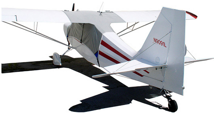
Bellanca Citabria Over-Top Canopy, extended to cover gas caps