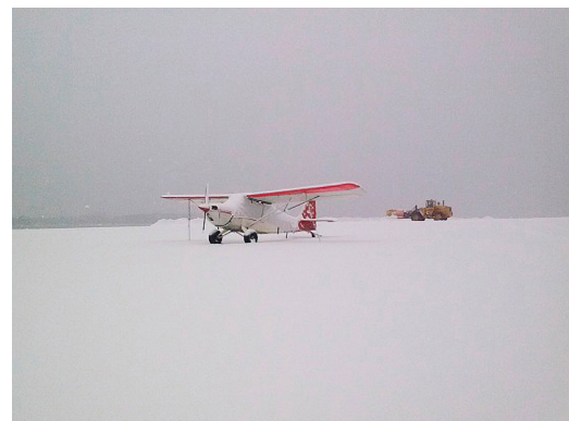
Bellanca Over-Top Canopy Cover Installation Instructions