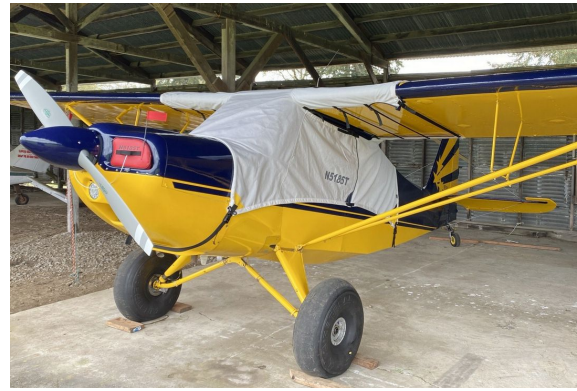
Bellanca Decathlon Canopy Cover (Over-Top, Extended to tail), Wing Covers, Engine Plugs