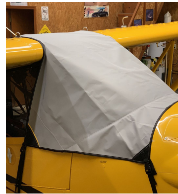
Cub Crafter's Carbon Cub FX3 Windshield/Skylight Cover, travel weight