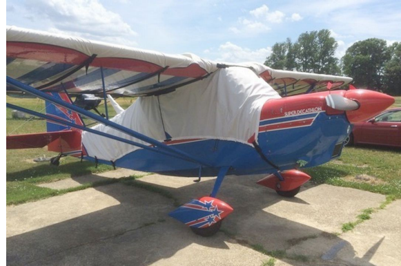
Bellanca Decathlon Canopy Cover (Over-Top, Extended to tail), Wing Covers, Engine Plugs