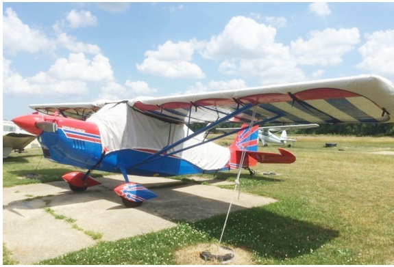
Bellanca Decathlon Canopy Cover (Over-Top, Extended to tail), Wing Covers, Engine Plugs