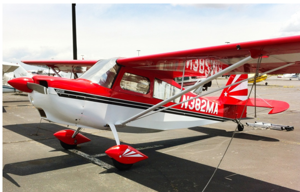
Bellanca Decathlon HeatShield Set

Windshield Heatshields are interior sunshades for an aircraft's front windshield. The product is a unique composite of closed-cell foam with a silver mylar finish. The semi-rigid design is stiff enough to stand along the inside of the windshield using sun visors or window framing. It folds up flat and easily stores in the included storage sleeve. Some designs may require velcro and suction cups or split right and left sides. A Heatshield is an excellent short-term remedy for cockpit overheating. An external fabric cover is far more effective and practical for long-term protection.