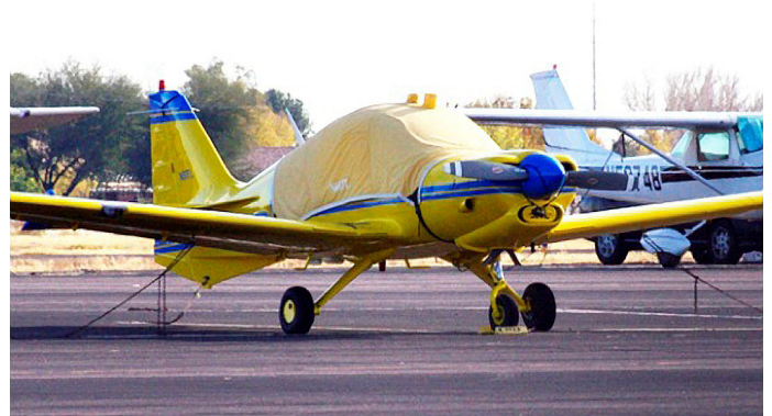
Beagle Pup Canopy Cover