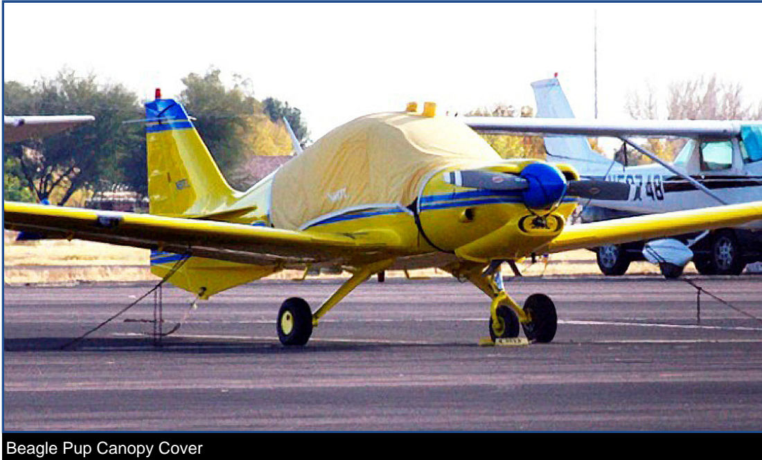
Beagle Pup Canopy Cover