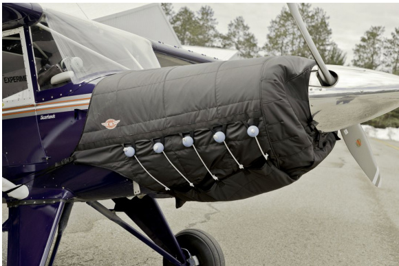
Bearhawk Insulated Engine Cover