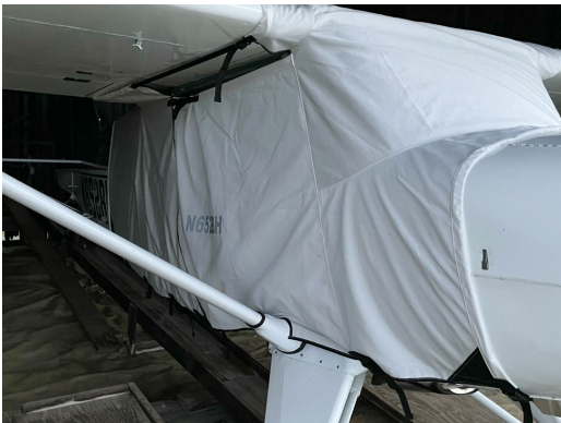
Avipro Bearhawk Extended Over The Top Canopy Cover

This cover type is made from Silver Acrylic Sunbrella canvas and is 100% lined with a soft and smooth microfiber. Bruce's Custom Covers developed this material combination especially for aircraft protection. The outer material is medium weight and treated for water resistance, UV resistance and anti-static buildup. The inner lining is a very soft and smooth microfiber to prevent scratching. The material is very reflective, and tests show that the cabin interior temperature can be reduced to near-ambient temperature on the hottest of days. It is water, ice and snow repellent, yet breathable to allow moisture to escape from between the cover and the aircraft surface.