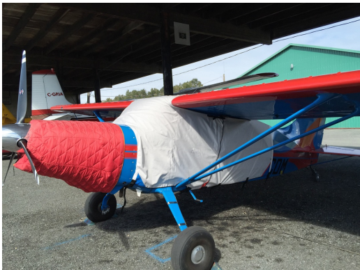
Maule Over-Top Extended Canopy Cover