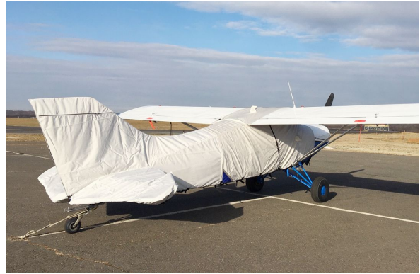
Maule M-5-235C Extended Canopy Cover, Empennage Cover