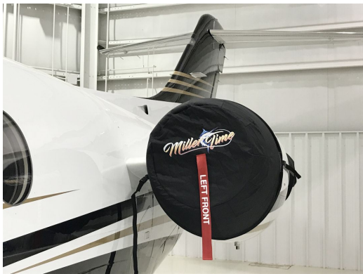
Raytheon 400A Engine Covers

The Hawker Beechcraft Beechjet 400, Hawker 400XP (T1A, T400 Jayhawk) Intake Covers are designed to install easily yet be completely storable. A spring steel hoop is sewn into the hem of each cover, allowing them to be installed without climbing onto the wing or using a stepladder. To store the covers the spring steel hoop folds like a band-saw blade into three nesting rings. Each cover folds into a compact circular bundle which is stored in the included duffle bag, yet they unfold quickly for use. The Tri-Fold Ring cover is made of medium weight nylon which is available in a variety of colors to match the paint trim. Each cover set comes complete with installation and folding instructions. The aircraft's registration number can be silkscreened onto the cover for an extra charge.