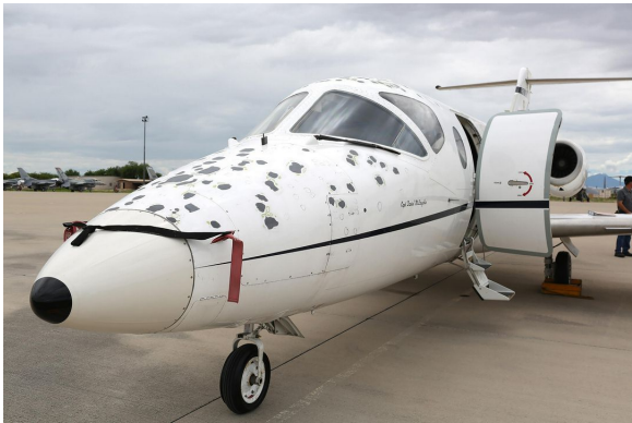
Raytheon Beechjet Hail Damage, and Pitot Covers

The Engine Inlet Plugs are custom fit for your Hawker Beechcraft Beechjet 400, Hawker 400XP (T1A, T400 Jayhawk) intakes, made with heavy-duty vinyl material, and stuffed with a single block of sculpted urethane foam. Each plug has a zipper that allows the foam to be removed and dried if necessary. Engine plugs have 'remove before flight' streamers sewn onto the face of the plugs. Most plugs are imprinted with the aircraft registration number in black for an extra charge. Storage bag NOT included. Engine plugs may be inserted after flight when the engine is still warm. Engine Inlet Plugs are commonly referred to as Cowl Plugs, Intake Plugs, Cowl Blocks, Engine Blocks, and Engine Bung.