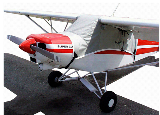
Piper PA-18 Super Cub Canopy Cover