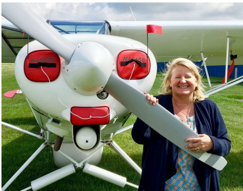
Piper PA-18 Super Cub Engine Inlet Plugs

Engine Inlet Plugs are custom fit for your Badlands Traveler intakes, made with heavy-duty vinyl material, and stuffed with a single block of sculpted urethane foam. Each plug has a zipper that allows the foam to be removed and dried if necessary. Engine plugs have warning flags that are visible from the cockpit or 'remove before flight' streamers sewn onto the face of the plugs. Most plugs are imprinted with the aircraft registration number in black for an extra charge. Storage bag NOT included. Engine plugs may be inserted after flight when the engine is still warm. Engine Inlet Plugs are commonly referred to as Cowl Plugs, Intake Plugs, Cowl Blocks, Engine Blocks, and Engine Bungs.