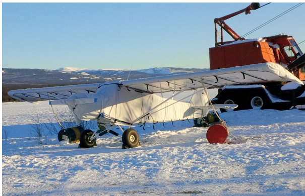
Piper Super Cub Complete Cover Set

ALL-YEAR USE MATERIAL - Made with Silver Acrylic Sunbrella canvas, the all-year use material is the best option for sun protection and cover longevity. This heavier more durable material is intended for all weather conditions, such as rain and snow or lots of sun.