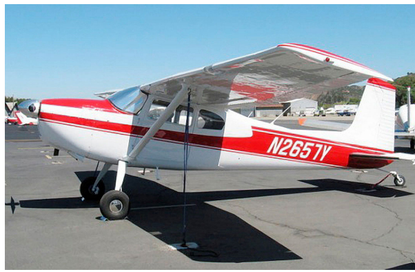
Cessna 180 & 185 Windshield HeatShield