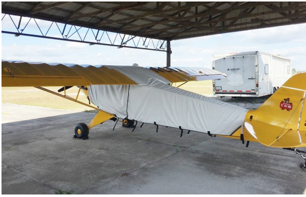
Piper J3 Cub Extended Canopy Cover, also extended back to tail planes.