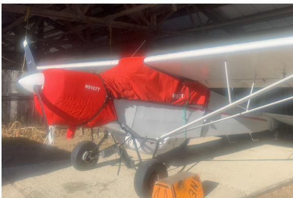
Piper PA-18 Super Cub Insulated Engine Cover, Canopy Cover

This cover type is made from Silver Acrylic Sunbrella canvas and is 100% lined with a soft and smooth microfiber. Bruce's Custom Covers developed this material combination especially for aircraft protection. The outer material is medium weight and treated for water resistance, UV resistance and anti-static buildup. The inner lining is a very soft and smooth microfiber to prevent scratching. The material is very reflective, and tests show that the cabin interior temperature can be reduced to near-ambient temperature on the hottest of days. It is water, ice and snow repellent, yet breathable to allow moisture to escape from between the cover and the aircraft surface.