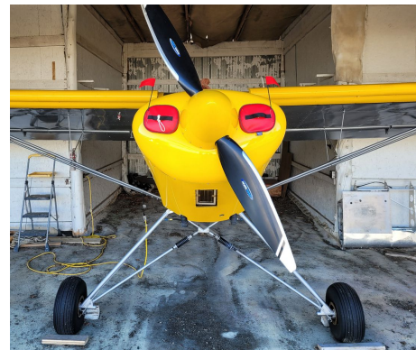
Preceptor STOL King Engine Plugs