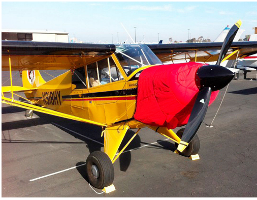
Aviat Husky Insulated Engine Cover