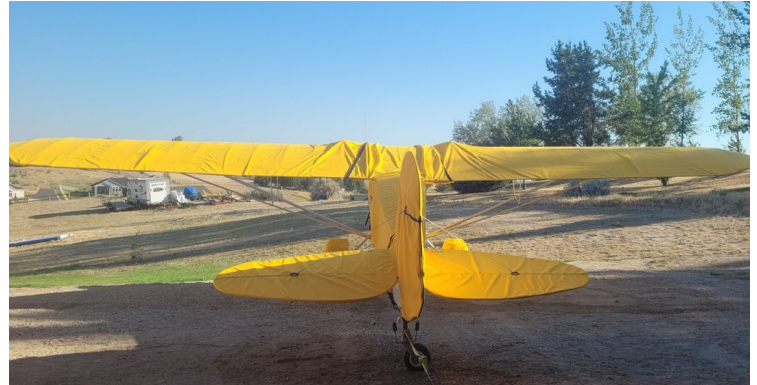
Piper PA-18 All Weather Cover Set