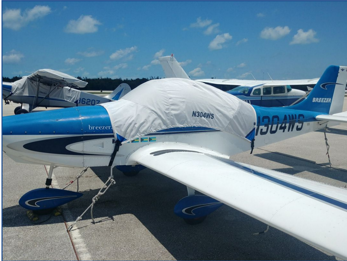
Ikarus Breezer Canopy Cover