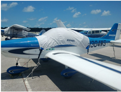
Ikarus Breezer Canopy Cover

This cover type is made from Silver Acrylic Sunbrella canvas and is 100% lined with a soft and smooth microfiber. Bruce's Custom Covers developed this material combination especially for aircraft protection. The outer material is medium weight and treated for water resistance, UV resistance and anti-static buildup. The inner lining is a very soft and smooth microfiber to prevent scratching. The material is very reflective, and tests show that the cabin interior temperature can be reduced to near-ambient temperature on the hottest of days. It is water, ice and snow repellent, yet breathable to allow moisture to escape from between the cover and the aircraft surface.