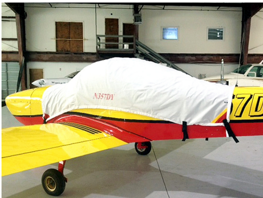
Ikarus Breezer Canopy Cover

This cover type is made from Silver Acrylic Sunbrella canvas and is 100% lined with a soft and smooth microfiber. Bruce's Custom Covers developed this material combination especially for aircraft protection. The outer material is medium weight and treated for water resistance, UV resistance and anti-static buildup. The inner lining is a very soft and smooth microfiber to prevent scratching. The material is very reflective, and tests show that the cabin interior temperature can be reduced to near-ambient temperature on the hottest of days. It is water, ice and snow repellent, yet breathable to allow moisture to escape from between the cover and the aircraft surface.