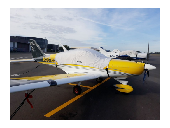
Bristell S-LSA NG5 Canopy Cover