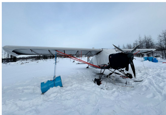
Bushmaster Wing, Canopy & Insulated Engine Covers

WINTER USE MATERIAL - Made with Solution-Dyed Polyester fabric, this option is intended for seasonal use to aid in deicing, rain mitigation, or for occasional travel. The material is lighter and more compact, but more susceptible to UV damage and may have a shorter useful life if used continuously outside than the all-year use material.