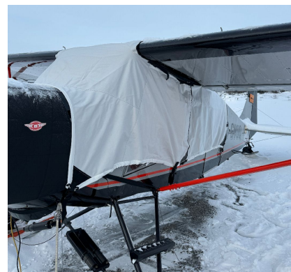
Bushmaster Canopy & Insulated Engine Covers