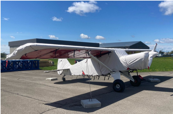
Bearhawk 4-Place Complete Cover Set, AFTER