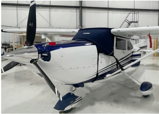
Cessna 182 Windshield Cover, Engine Plugs