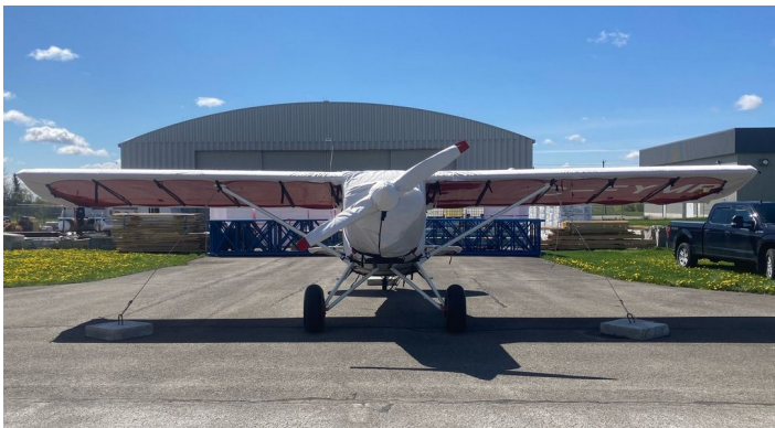
Bearhawk 4-Place Complete Cover Set