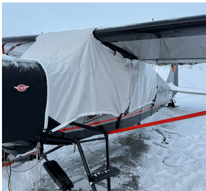
Bushmaster Canopy & Insulated Engine Covers

WINTER USE MATERIAL - Made with Solution-Dyed Polyester fabric, this option is intended for seasonal use to aid in deicing, rain mitigation, or for occasional travel. The material is lighter and more compact, but more susceptible to UV damage and may have a shorter useful life if used continuously outside than the all-year use material.