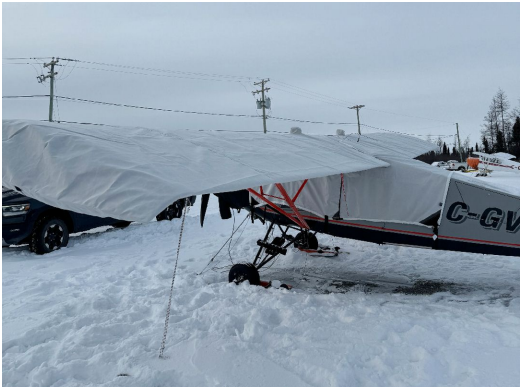
Bushmaster Wing Covers, Canopy Cover

This cover type is made from Silver Acrylic Sunbrella canvas and is 100% lined with a soft and smooth microfiber. Bruce's Custom Covers developed this material combination especially for aircraft protection. The outer material is medium weight and treated for water resistance, UV resistance and anti-static buildup. The inner lining is a very soft and smooth microfiber to prevent scratching. The material is very reflective, and tests show that the cabin interior temperature can be reduced to near-ambient temperature on the hottest of days. It is water, ice and snow repellent, yet breathable to allow moisture to escape from between the cover and the aircraft surface.