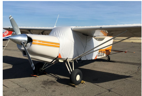
Maule M-5-235C Extended Canopy Cover