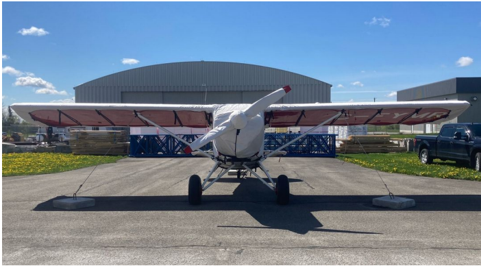
Bearhawk 4-Place Complete Cover Set

This cover type is made from Silver Acrylic Sunbrella canvas and is 100% lined with a soft and smooth microfiber. Bruce's Custom Covers developed this material combination especially for aircraft protection. The outer material is medium weight and treated for water resistance, UV resistance and anti-static buildup. The inner lining is a very soft and smooth microfiber to prevent scratching. The material is very reflective, and tests show that the cabin interior temperature can be reduced to near-ambient temperature on the hottest of days. It is water, ice and snow repellent, yet breathable to allow moisture to escape from between the cover and the aircraft surface.