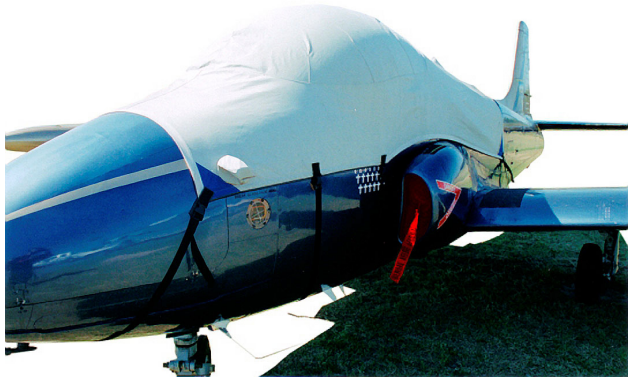
Covers & Plugs for the Jet Provost

This cover type is made from Silver Acrylic Sunbrella canvas and is 100% lined with a soft and smooth microfiber. Bruce's Custom Covers developed this material combination especially for aircraft protection. The outer material is medium weight and treated for water resistance, UV resistance and anti-static buildup. The inner lining is a very soft and smooth microfiber to prevent scratching. The material is very reflective, and tests show that the cabin interior temperature can be reduced to near-ambient temperature on the hottest of days. It is water, ice and snow repellent, yet breathable to allow moisture to escape from between the cover and the aircraft surface.