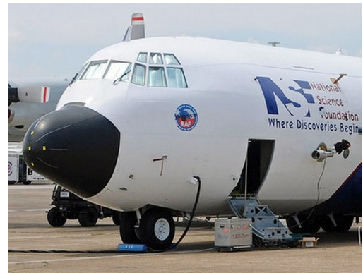
Lockheed C-130 Flight Deck HeatShield Set