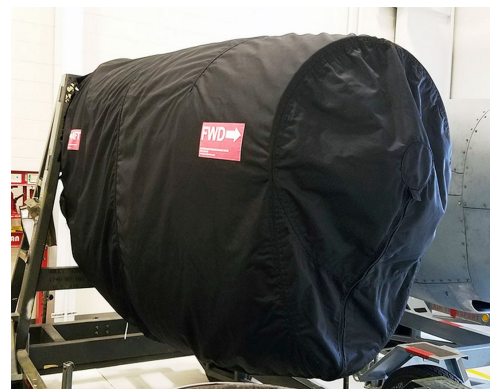
C-130 QEC / Maintenance Cover Set