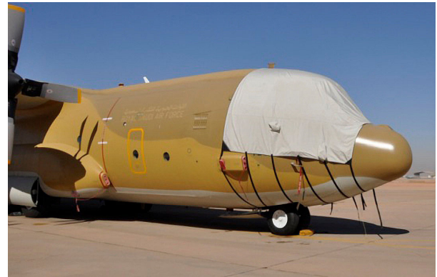
C-130 Cockpit Cover (Windshield/Flight Deck)