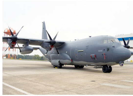
Various plugs and covers for MC-130J(Pitot Covers, Air Conditioning Plugs, Engine Plugs)