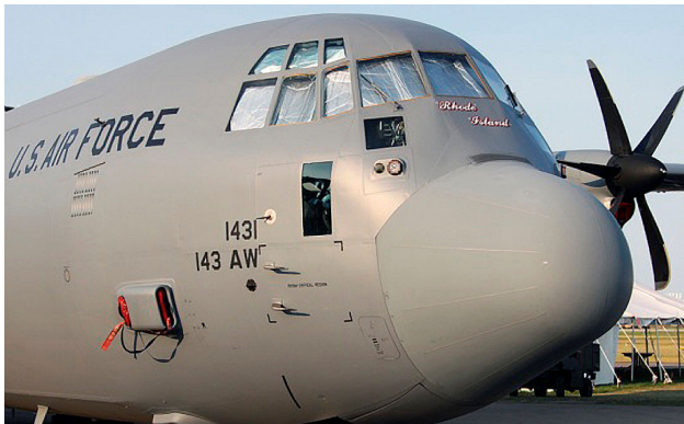
C-130 Cockpit HeatShields

Windshield and Skylight Heatshields are interior sunshades for an aircraft's front windshield and overhead window. The product is a unique composite of closed-cell foam with a silver mylar finish. The semi-rigid design is stiff enough to stand along the inside of the windshield using sun visors or window framing. It folds up flat and easily stores in the included storage sleeve. Some designs may require velcro and suction cups or split right and left sides. A Heatshield is an excellent short-term remedy for cockpit overheating. An external fabric cover is far more effective and practical for long-term protection.