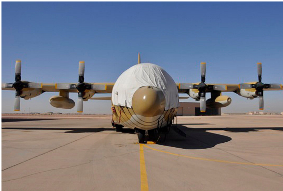
C-130 Cockpit Cover (Windshield/Flight Deck)

This cover type is made from Silver Acrylic Sunbrella canvas and is 100% lined with a soft and smooth microfiber. Bruce's Custom Covers developed this material combination especially for aircraft protection. The outer material is medium weight and treated for water resistance, UV resistance and anti-static buildup. The inner lining is a very soft and smooth microfiber to prevent scratching. The material is very reflective, and tests show that the cabin interior temperature can be reduced to near-ambient temperature on the hottest of days. It is water, ice and snow repellent, yet breathable to allow moisture to escape from between the cover and the aircraft surface.