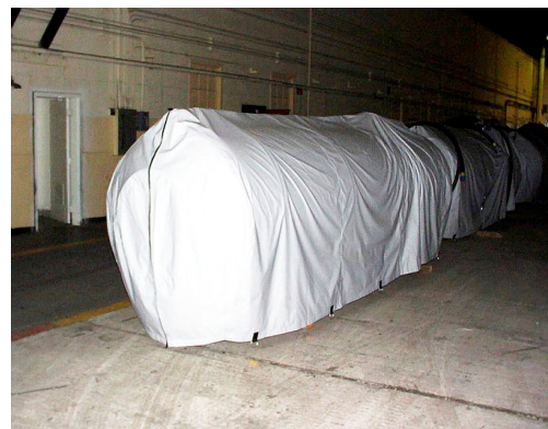
C-130 Aux. Fuel Tank Covers