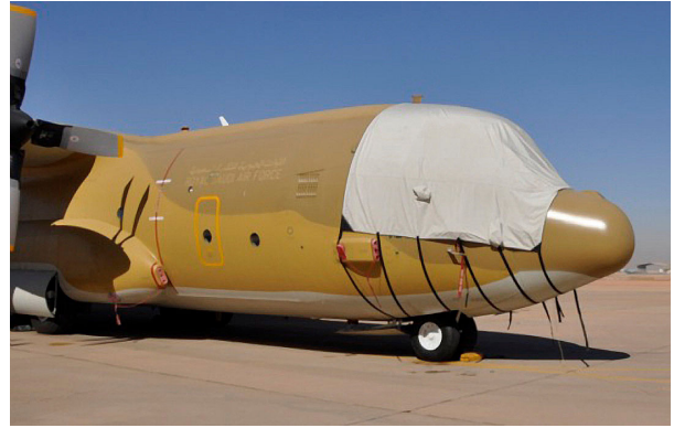
C-130 Cockpit Cover (Windshield/Flight Deck)