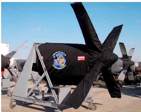
C130 Maintenance Storage Engine, Exhaust, and Prop/Spinner Cover set

This cover type is made from Silver Acrylic Sunbrella canvas and is 100% lined with a soft and smooth microfiber. Bruce's Custom Covers developed this material combination especially for aircraft protection. The outer material is medium weight and treated for water resistance, UV resistance and anti-static buildup. The inner lining is a very soft and smooth microfiber to prevent scratching. The material is very reflective, and tests show that the cabin interior temperature can be reduced to near-ambient temperature on the hottest of days. It is water, ice and snow repellent, yet breathable to allow moisture to escape from between the cover and the aircraft surface.