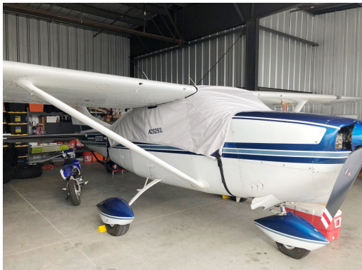
Cessna 206 Wrap-Around Canopy Cover

This cover type is made from Silver Acrylic Sunbrella canvas and is 100% lined with a soft and smooth microfiber. Bruce's Custom Covers developed this material combination especially for aircraft protection. The outer material is medium weight and treated for water resistance, UV resistance and anti-static buildup. The inner lining is a very soft and smooth microfiber to prevent scratching. The material is very reflective, and tests show that the cabin interior temperature can be reduced to near-ambient temperature on the hottest of days. It is water, ice and snow repellent, yet breathable to allow moisture to escape from between the cover and the aircraft surface.