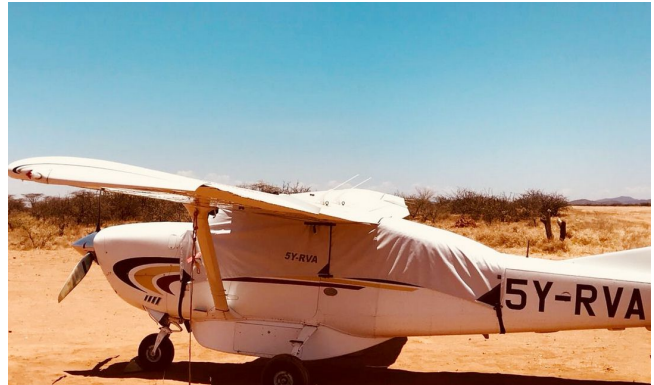
Cessna 206 Canopy Cover