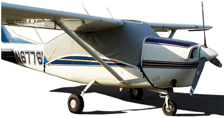
Canopy covers are available in belly strap, snap-on or Over-the-Top Styles