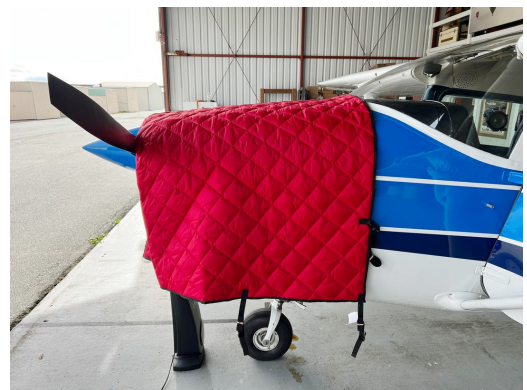
Insulated Hangar Blanket on Cessna 182