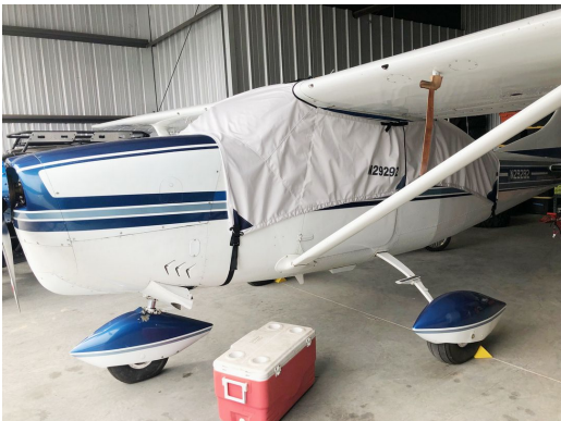
Cessna 206 Wrap-Around Canopy Cover