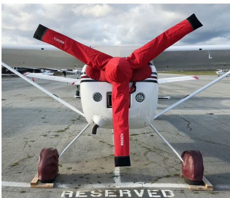
Cessna Skywagon Propellor/Spinner Cover, 3-blade type

This cover type is made from Silver Acrylic Sunbrella canvas and is 100% lined with a soft and smooth microfiber. Bruce's Custom Covers developed this material combination especially for aircraft protection. The outer material is medium weight and treated for water resistance, UV resistance and anti-static buildup. The inner lining is a very soft and smooth microfiber to prevent scratching. The material is very reflective, and tests show that the cabin interior temperature can be reduced to near-ambient temperature on the hottest of days. It is water, ice and snow repellent, yet breathable to allow moisture to escape from between the cover and the aircraft surface.