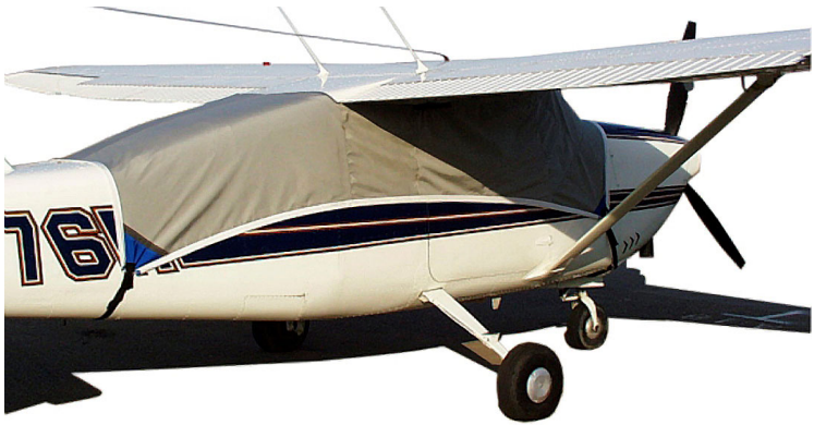
Cessna 206 Standard Canopy Cover