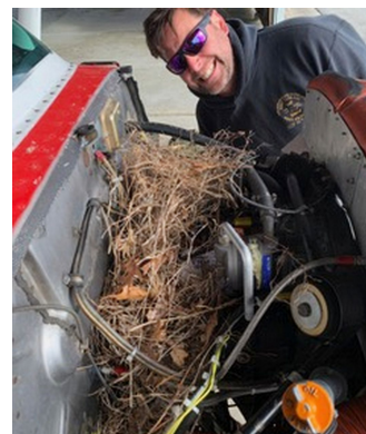
Cessna 172 Bird Nest Problem