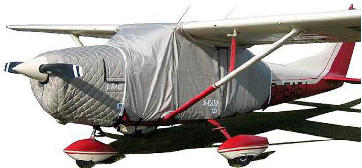
Insulated Hangar Blanket on Cessna 182 Cessna 182 Insulated Engine Cover ext. to l.e of nose gear, Extended Canopy Cover