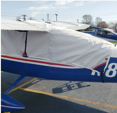
Cessna 205 Over The Top Style Canopy Cover

This cover type is made from Silver Acrylic Sunbrella canvas and is 100% lined with a soft and smooth microfiber. Bruce's Custom Covers developed this material combination especially for aircraft protection. The outer material is medium weight and treated for water resistance, UV resistance and anti-static buildup. The inner lining is a very soft and smooth microfiber to prevent scratching. The material is very reflective, and tests show that the cabin interior temperature can be reduced to near-ambient temperature on the hottest of days. It is water, ice and snow repellent, yet breathable to allow moisture to escape from between the cover and the aircraft surface.