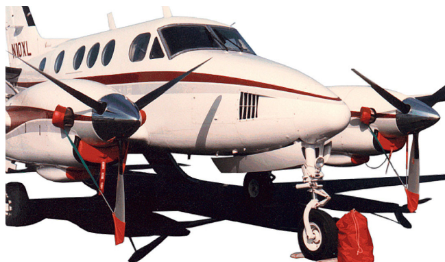
Pitot, Exhaust Covers, Engine Plugs &amp; Prop Ties