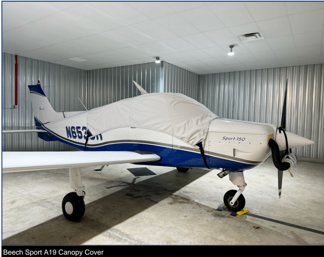
Beech Sport A19 Canopy Cover