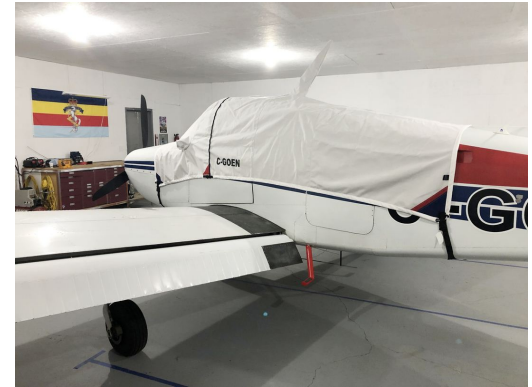
Beech Sierra B24R Canopy Cover