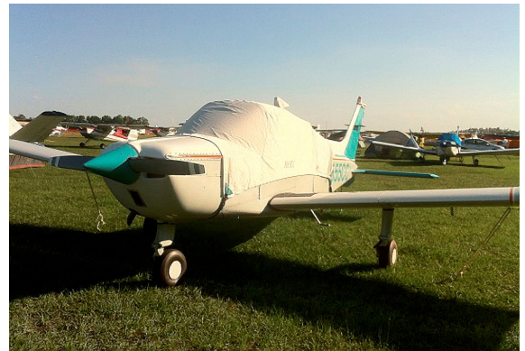
Beech C23 Sundowner Canopy Cover