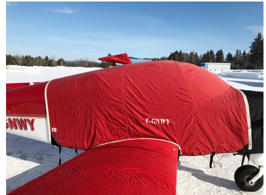
Beech Sundowner Extended Canopy & Wing Covers