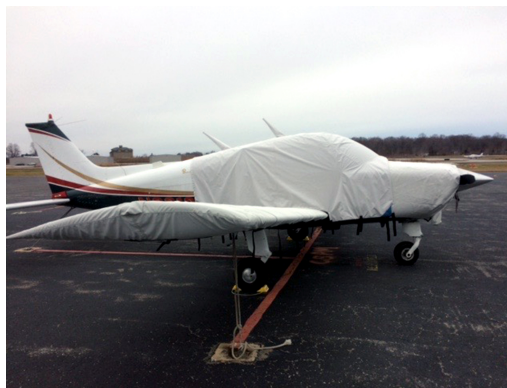
Beech Sundowner Extended Canopy Cover, Engine, and Wing Covers