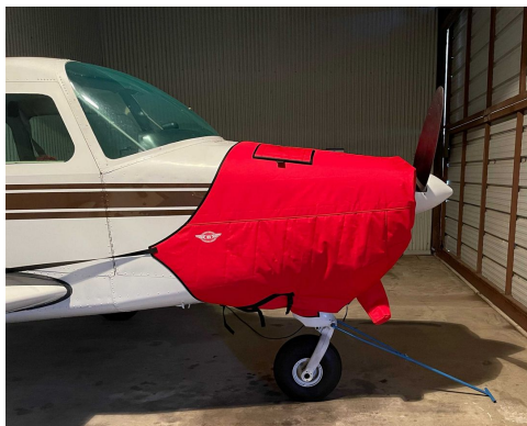
Beech Musketeer Insulated Engine Covers

This cover type is made from Silver Acrylic Sunbrella canvas and is 100% lined with a soft and smooth microfiber. Bruce's Custom Covers developed this material combination especially for aircraft protection. The outer material is medium weight and treated for water resistance, UV resistance and anti-static buildup. The inner lining is a very soft and smooth microfiber to prevent scratching. The material is very reflective, and tests show that the cabin interior temperature can be reduced to near-ambient temperature on the hottest of days. It is water, ice and snow repellent, yet breathable to allow moisture to escape from between the cover and the aircraft surface.