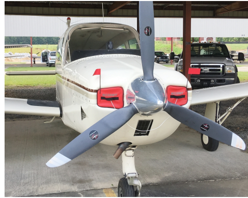
Beech Sierra Engine Inlet Plugs