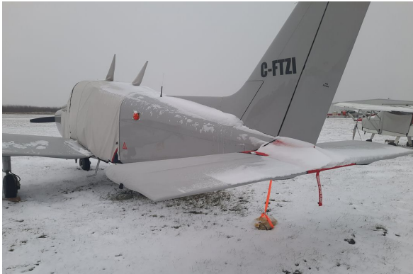
Beech C23 Sundowner Horizontal Stabilizer Covers, Tailcone Cover

This cover type is made from Silver Acrylic Sunbrella canvas and is 100% lined with a soft and smooth microfiber. Bruce's Custom Covers developed this material combination especially for aircraft protection. The outer material is medium weight and treated for water resistance, UV resistance and anti-static buildup. The inner lining is a very soft and smooth microfiber to prevent scratching. The material is very reflective, and tests show that the cabin interior temperature can be reduced to near-ambient temperature on the hottest of days. It is water, ice and snow repellent, yet breathable to allow moisture to escape from between the cover and the aircraft surface.