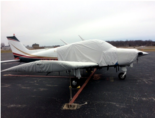
Beech Sundowner Extended Canopy Cover, Engine, and Wing Covers

WINTER USE MATERIAL - Made with Solution-Dyed Polyester fabric, this option is intended for seasonal use to aid in deicing, rain mitigation, or for occasional travel. The material is lighter and more compact, but more susceptible to UV damage and may have a shorter useful life if used continuously outside than the all-year use material.