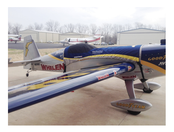
Extra 300SC with NASCAR style custom cover