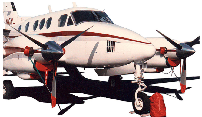
Pitot, Exhaust Covers, Engine Plugs & Prop Ties