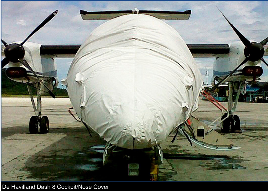
De Havilland Dash 8 Cockpit/Nose Cover