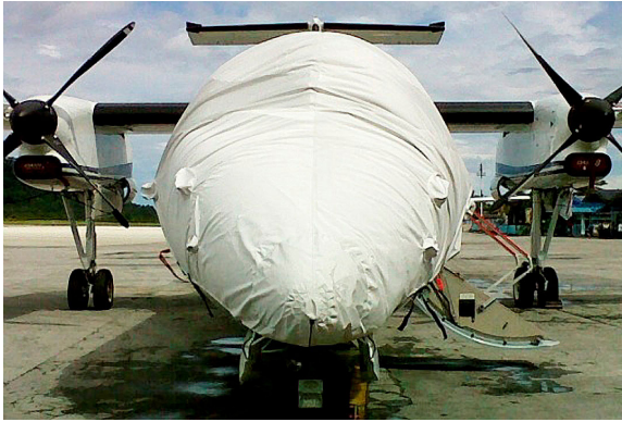
De Havilland Dash 8 Cockpit/Nose Cover

This cover type is made from Silver Acrylic Sunbrella canvas and is 100% lined with a soft and smooth microfiber. Bruce's Custom Covers developed this material combination especially for aircraft protection. The outer material is medium weight and treated for water resistance, UV resistance and anti-static buildup. The inner lining is a very soft and smooth microfiber to prevent scratching. The material is very reflective, and tests show that the cabin interior temperature can be reduced to near-ambient temperature on the hottest of days. It is water, ice and snow repellent, yet breathable to allow moisture to escape from between the cover and the aircraft surface.