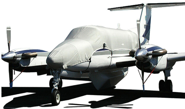
King Air Canopy/Nose Cover

Engine Inlet Plugs are custom fit for your Casa/IPTN CN-235 intakes, made with heavy-duty vinyl material, and stuffed with a single block of sculpted urethane foam. Each plug has a zipper that allows the foam to be removed and dried if necessary. Engine plugs have warning flags that are visible from the cockpit or 'remove before flight' streamers sewn onto the face of the plugs. Most plugs are imprinted with the aircraft registration number in black for an extra charge. Storage bag NOT included. Engine plugs may be inserted after flight when the engine is still warm. Engine Inlet Plugs are commonly referred to as Cowl Plugs, Intake Plugs, Cowl Blocks, Engine Blocks, and Engine Bungs.