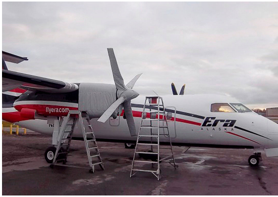
Dash 8 Insulated Engine & Prop Covers