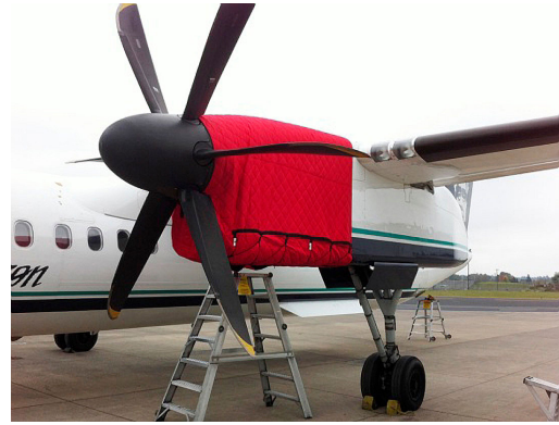
Dash 8-Q400 Insulated Engine Cover