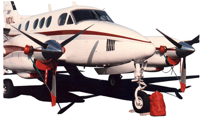
Pitot, Exhaust Covers, Engine Plugs & Prop Ties