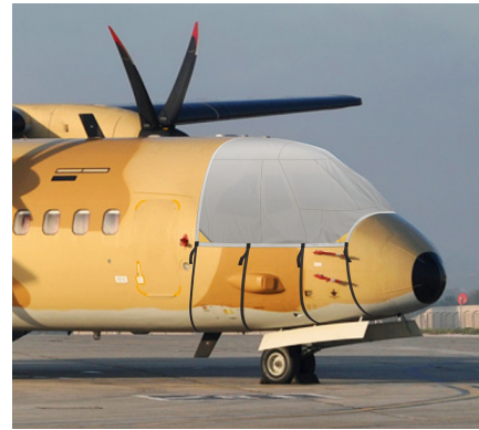
Casa C-295 Cockpit Cover (illustration)