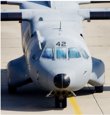
Casa C-295 Cockpit HeatShields (illustration)

This cover type is made from Silver Acrylic Sunbrella canvas and is 100% lined with a soft and smooth microfiber. Bruce's Custom Covers developed this material combination especially for aircraft protection. The outer material is medium weight and treated for water resistance, UV resistance and anti-static buildup. The inner lining is a very soft and smooth microfiber to prevent scratching. The material is very reflective, and tests show that the cabin interior temperature can be reduced to near-ambient temperature on the hottest of days. It is water, ice and snow repellent, yet breathable to allow moisture to escape from between the cover and the aircraft surface.