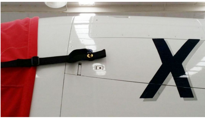
Challenger 300 Intake Covers