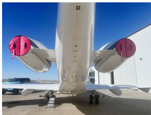
Canadair Challenger 300 Exhaust Plugs