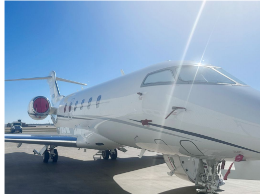
Canadair Challenger 300 Cockpit HeatShields, Intake Plugs