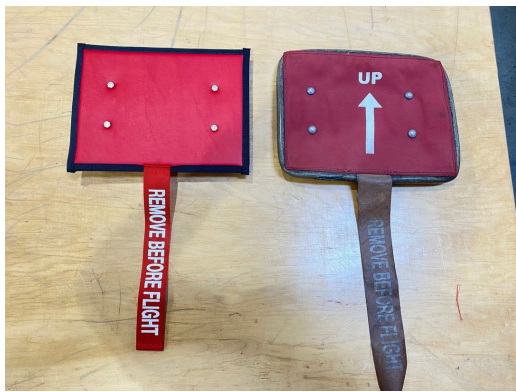
Canadair Challenger 300, 350 APU Intake Cover