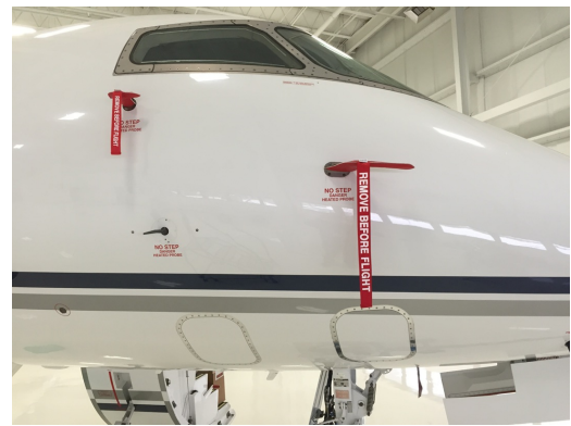
Challenger 300 Pitot Covers