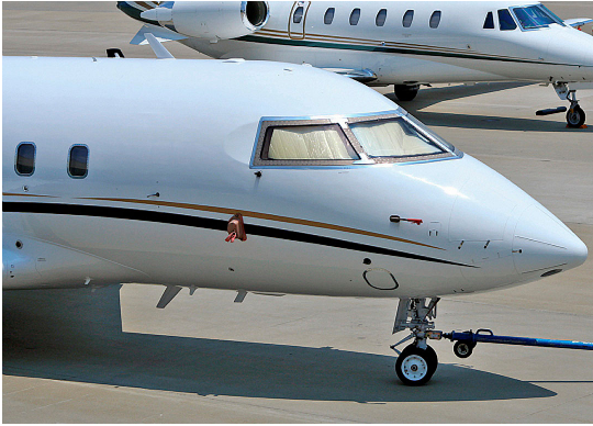
Challenger 604 Cockpit HeatShields