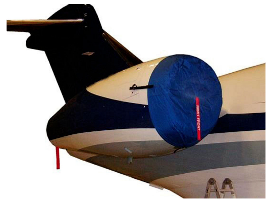
Challenger 300 Intake Covers (set of 2), come in colors