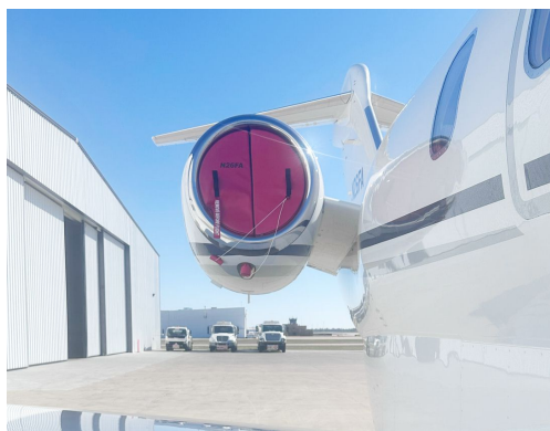
Canadair Challenger 300 Intake Plugs