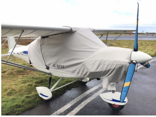
Ikarus C-42 Extended Canopy/Engine Cover