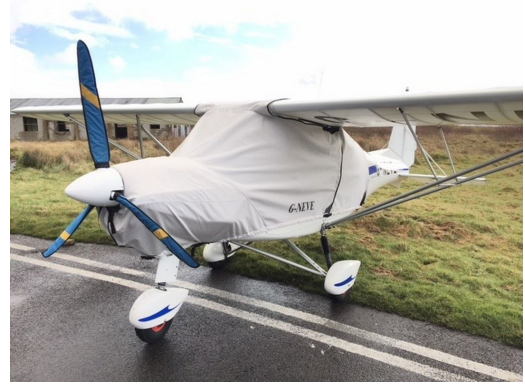
Ikarus C-42 Extended Canopy/Engine Cover