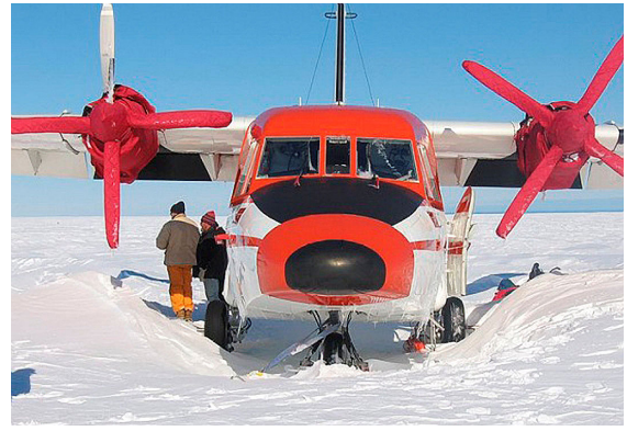
Casa 212 Insulated Engine & Propellor/Spinner Covers