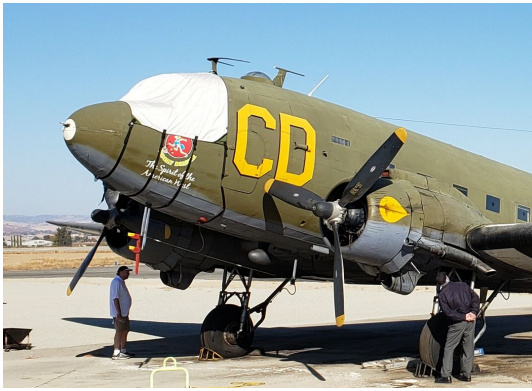
Douglas DC-3 Cockpit Cover