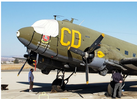
Douglas DC-3 Cockpit Cover