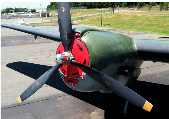
C-46 Radial Engine Intake Plug

Engine Inlet Plugs are custom fit for your Curtiss Wright C-46 Commando intakes, made with heavy-duty vinyl material, and stuffed with a single block of sculpted urethane foam. Each plug has a zipper that allows the foam to be removed and dried if necessary. Engine plugs have warning flags that are visible from the cockpit or 'remove before flight' streamers sewn onto the face of the plugs. Most plugs are imprinted with the aircraft registration number in black for an extra charge. Storage bag NOT included. Engine plugs may be inserted after flight when the engine is still warm. Engine Inlet Plugs are commonly referred to as Cowl Plugs, Intake Plugs, Cowl Blocks, Engine Blocks, and Engine Bunges.