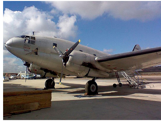
Covers, Plugs and related items for the C-46 Commando