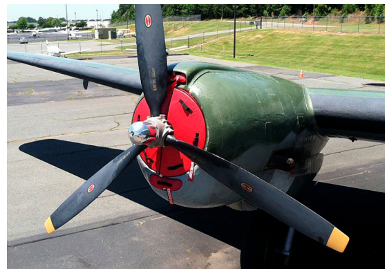
C-46 Radial Engine Intake Plug