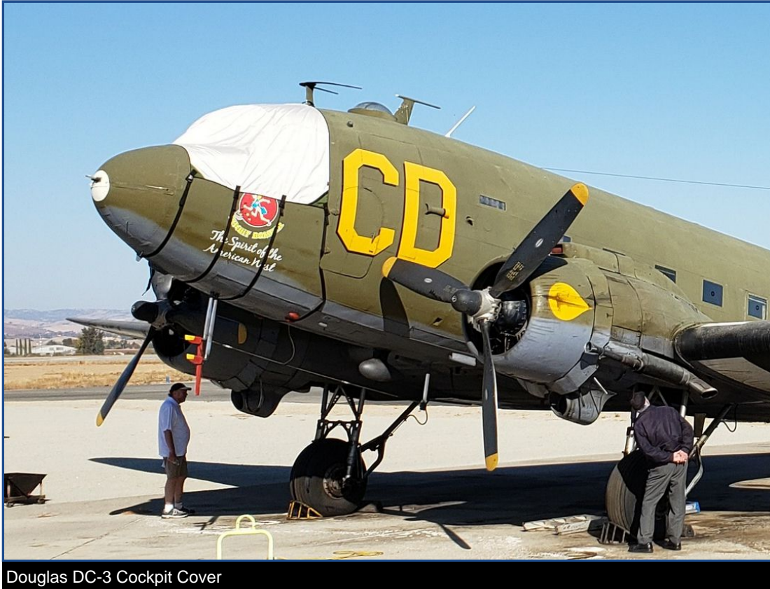
Douglas DC-3 Cockpit Cover