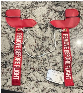
Cessna Citation Pitot Cover Set

The Engine Inlet Plugs are custom fit for your Cessna Citation I (500/501) intakes, made with heavy-duty vinyl material, and stuffed with a single block of sculpted urethane foam. Each plug has a zipper that allows the foam to be removed and dried if necessary. Engine plugs have 'remove before flight' streamers sewn onto the face of the plugs. Most plugs are imprinted with the aircraft registration number in black for an extra charge. Storage bag NOT included. Engine plugs may be inserted after flight when the engine is still warm. Engine Inlet Plugs are commonly referred to as Cowl Plugs, Intake Plugs, Cowl Blocks, Engine Blocks, and Engine Bungs.