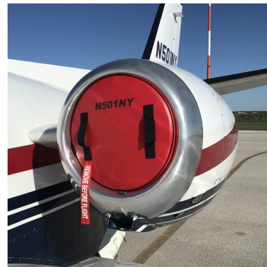
Citation 501 Intake/Exhaust Plug Set