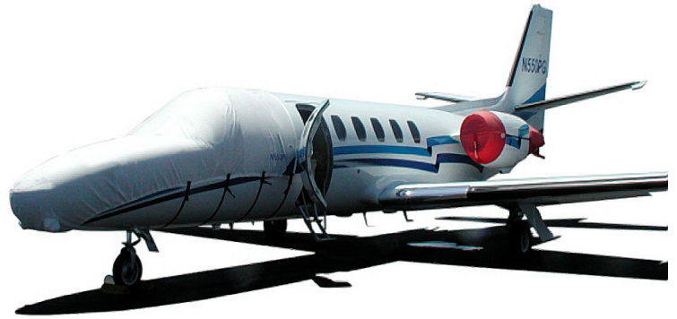
Cessna Citation Nose/Cockpit Cover, Engine Covers