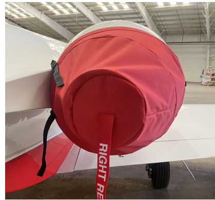
Cessna 501 Engine Covers NO TR's