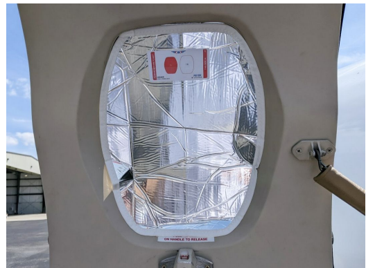
Citationjet Entrance Door Heatshield