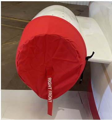
Cessna 501 Engine Covers NO TR's

The Cessna Citation I (500/501) Intake Covers are designed to install easily yet be completely storable. A spring steel hoop is sewn into the hem of each cover, allowing them to be installed without climbing onto the wing or using a stepladder. To store the covers the spring steel hoop folds like a band-saw blade into three nesting rings. Each cover folds into a compact circular bundle which is stored in the included duffle bag, yet they unfold quickly for use. The Tri-Fold Ring cover is made of medium weight nylon which is available in a variety of colors to match the paint trim. Each cover set comes complete with installation and folding instructions. The aircraft's registration number can be silkscreened onto the cover for an extra charge.