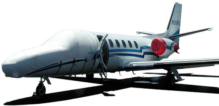
Cessna Citation Nose/Cockpit Cover, Engine Covers

This cover type is made from Silver Acrylic Sunbrella canvas and is 100% lined with a soft and smooth microfiber. Bruce's Custom Covers developed this material combination especially for aircraft protection. The outer material is medium weight and treated for water resistance, UV resistance and anti-static buildup. The inner lining is a very soft and smooth microfiber to prevent scratching. The material is very reflective, and tests show that the cabin interior temperature can be reduced to near-ambient temperature on the hottest of days. It is water, ice and snow repellent, yet breathable to allow moisture to escape from between the cover and the aircraft surface.