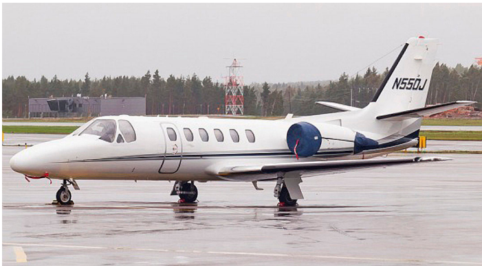
Cessna Citation Bravo Engine Covers and Pitot Covers sets

The Cessna Citation I (500/501) Intake Covers are designed to install easily yet be completely storable. A spring steel hoop is sewn into the hem of each cover, allowing them to be installed without climbing onto the wing or using a stepladder. To store the covers the spring steel hoop folds like a band-saw blade into three nesting rings. Each cover folds into a compact circular bundle which is stored in the included duffle bag, yet they unfold quickly for use. The Tri-Fold Ring cover is made of medium weight nylon which is available in a variety of colors to match the paint trim. Each cover set comes complete with installation and folding instructions. The aircraft's registration number can be silkscreened onto the cover for an extra charge.