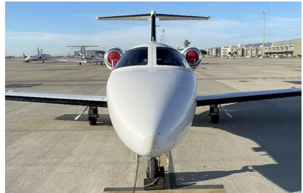
Cessna Mustang Engine Inlet Plugs