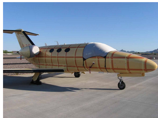
Citation Mustang Light Weight Windshield & Engine Covers