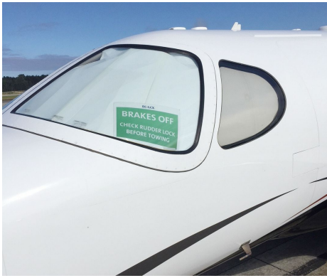
Cessna Mustang 510 Cockpit Heatshields