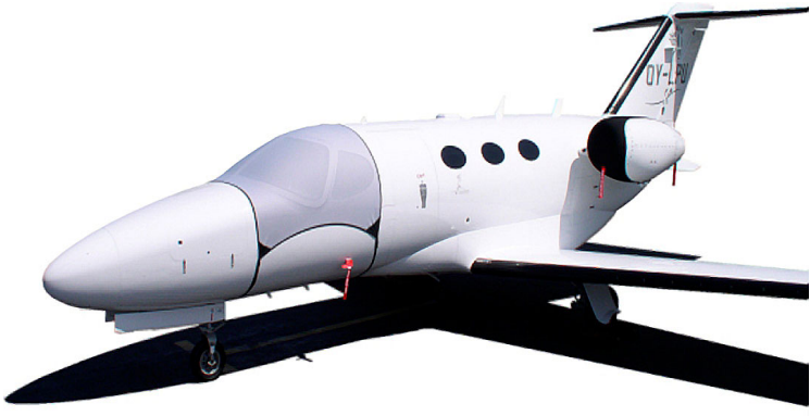
Citation Mustang Light Weight Travel Windshield Cover, "Bikini" type Engine Cover Set