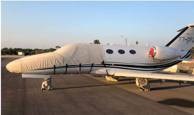
Cessna 510 Mustang Cockpit/Nose Cover, Engine Inlet Plugs

This cover type is made from Silver Acrylic Sunbrella canvas and is 100% lined with a soft and smooth microfiber. Bruce's Custom Covers developed this material combination especially for aircraft protection. The outer material is medium weight and treated for water resistance, UV resistance and anti-static buildup. The inner lining is a very soft and smooth microfiber to prevent scratching. The material is very reflective, and tests show that the cabin interior temperature can be reduced to near-ambient temperature on the hottest of days. It is water, ice and snow repellent, yet breathable to allow moisture to escape from between the cover and the aircraft surface.