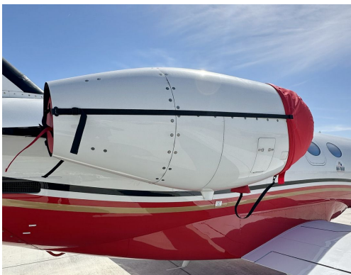
Cessna Citation Mustang 510 Intake Cover/Exhaust Plug Set

The Cessna Mustang 510 Intake/Exhaust Plugs are custom fit for the intake and exhaust openings, made with heavy-duty vinyl material, and stuffed with a single block of sculpted urethane foam. Each plug has a zipper that allows the foam to be removed and dried if necessary. Engine plugs have 'remove before flight' streamers sewn onto the face of the plugs. Most plugs are imprinted with the aircraft registration number in black. Engine plugs may be inserted after flight when the engine is still warm. Engine Inlet Plugs are commonly referred to as Cowl Plugs, Intake Plugs, Cowl Blocks, Engine Blocks, and Engine Bungs.