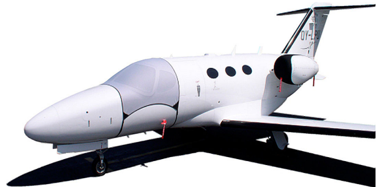
Citation Mustang Cockpit/Door/Nose Cover, Engine Inlet Cover Citation Mustang Light Weight Travel Windshield Cover, "Bikini" type Engine Cover Set