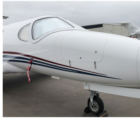
Cessna Mustang 510 Cockpit Heatshields, Pitot Cover/AOA