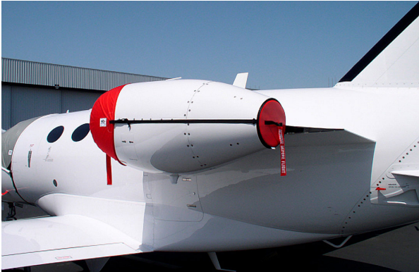
Citation Mustang Intake Cover/Exhaust Plug Set

The Cessna Mustang 510 Intake/Exhaust Plugs are custom fit for the intake and exhaust openings, made with heavy-duty vinyl material, and stuffed with a single block of sculpted urethane foam. Each plug has a zipper that allows the foam to be removed and dried if necessary. Engine plugs have 'remove before flight' streamers sewn onto the face of the plugs. Most plugs are imprinted with the aircraft registration number in black. Engine plugs may be inserted after flight when the engine is still warm. Engine Inlet Plugs are commonly referred to as Cowl Plugs, Intake Plugs, Cowl Blocks, Engine Blocks, and Engine Bungs.