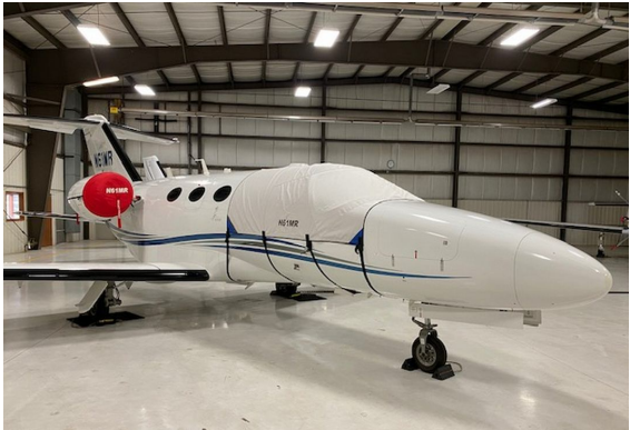
Cessna 510 Cockpit Cover extends to cover door