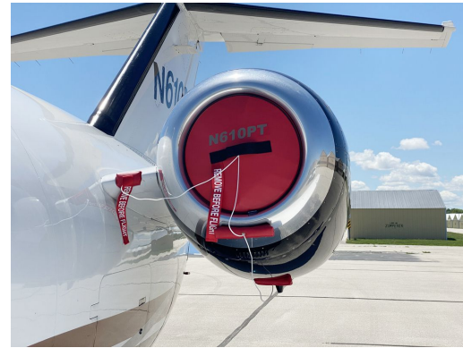
Cessna Citation Mustang 510 Engine Inlet Plugs, set of 8