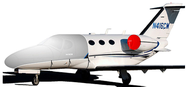
Citation Mustang Light Weight Windshield & Engine Covers