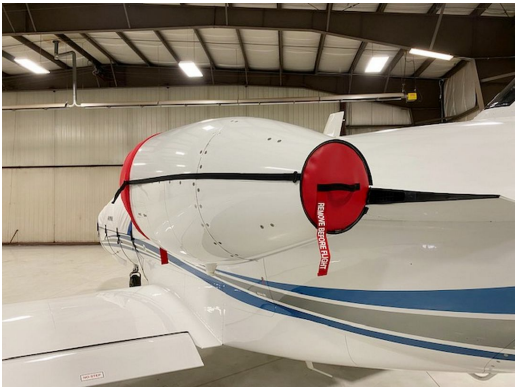
Cessna 510 Engine Inlet Covers & Exhaust Plugs