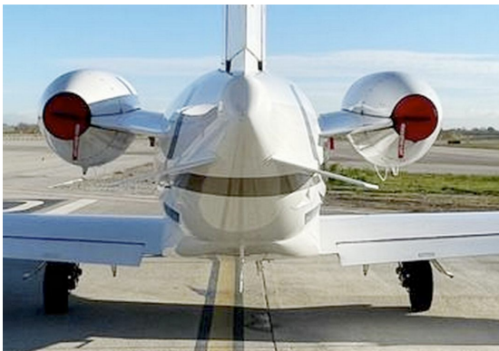
Cessna Mustang Exhaust Plugs

The Cessna Mustang 510 Intake/Exhaust Plugs are custom fit for the intake and exhaust openings, made with heavy-duty vinyl material, and stuffed with a single block of sculpted urethane foam. Each plug has a zipper that allows the foam to be removed and dried if necessary. Engine plugs have 'remove before flight' streamers sewn onto the face of the plugs. Most plugs are imprinted with the aircraft registration number in black. Engine plugs may be inserted after flight when the engine is still warm. Engine Inlet Plugs are commonly referred to as Cowl Plugs, Intake Plugs, Cowl Blocks, Engine Blocks, and Engine Bungs.