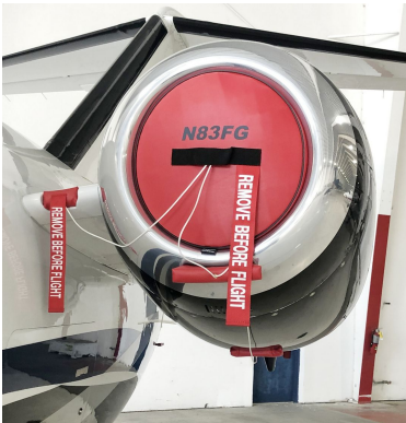
Cessna Mustang 510 Engine Inlet Plugs, Includes Intercooler Intake & Exhaust And Gen. Plugs

The Engine Inlet Plugs are custom fit for your Cessna Mustang 510 intakes, made with heavy-duty vinyl material, and stuffed with a single block of sculpted urethane foam. Each plug has a zipper that allows the foam to be removed and dried if necessary. Engine plugs have 'remove before flight' streamers sewn onto the face of the plugs. Most plugs are imprinted with the aircraft registration number in black for an extra charge. Storage bag NOT included. Engine plugs may be inserted after flight when the engine is still warm. Engine Inlet Plugs are commonly referred to as Cowl Plugs, Intake Plugs, Cowl Blocks, Engine Blocks, and Engine Bungs.