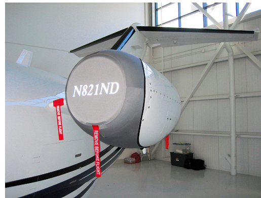
Citation Mustang Intake/Exhaust Cover, "Bikini" Type and leading edge Pylon inlet plugs