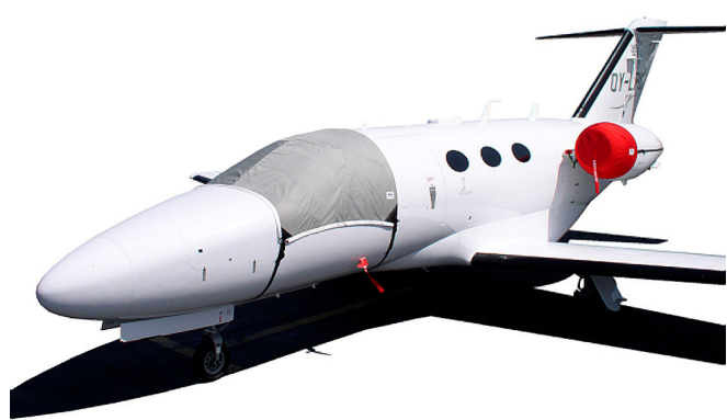
Citation Mustang Windshield Cover, Intake Cover/Exhaust Plug Set, Pitot Covers

Travel Covers are made with Silver Solution-Dyed Polyester fabric and only lined over the windshield to save weight. The material is lightweight and more compact for easy stowage in the aircraft. The polyester material is water resistant, but only intended for occasional use outside. We also have an ultra lightweight material available for fitted hangar dust covers. For daily outdoor use, the non-travel Sunbrella Cover is the best choice.