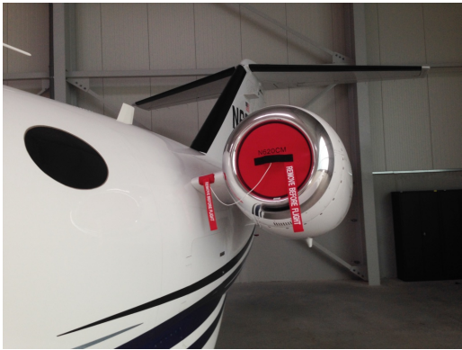
Citation Mustang Engine Intake Plugs

The Engine Inlet Plugs are custom fit for your Cessna Mustang 510 intakes, made with heavy-duty vinyl material, and stuffed with a single block of sculpted urethane foam. Each plug has a zipper that allows the foam to be removed and dried if necessary. Engine plugs have 'remove before flight' streamers sewn onto the face of the plugs. Most plugs are imprinted with the aircraft registration number in black for an extra charge. Storage bag NOT included. Engine plugs may be inserted after flight when the engine is still warm. Engine Inlet Plugs are commonly referred to as Cowl Plugs, Intake Plugs, Cowl Blocks, Engine Blocks, and Engine Bungs.