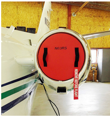
Cessna Citation S2 Intake Plugs

The Engine Inlet Plugs are custom fit for your Cessna Citation II (550, 551, UC-35A, with JT15D) intakes, made with heavy-duty vinyl material, and stuffed with a single block of sculpted urethane foam. Each plug has a zipper that allows the foam to be removed and dried if necessary. Engine plugs have 'remove before flight' streamers sewn onto the face of the plugs. Most plugs are imprinted with the aircraft registration number in black for an extra charge. Storage bag NOT included. Engine plugs may be inserted after flight when the engine is still warm. Engine Inlet Plugs are commonly referred to as Cowl Plugs, Intake Plugs, Cowl Blocks, Engine Blocks, and Engine Bungs.