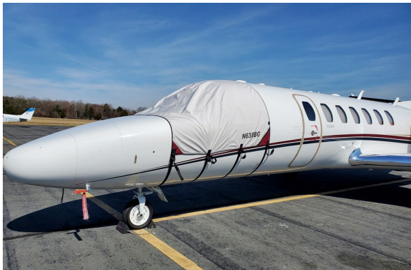
Cessna Citation 560 Cockpit Cover

This cover type is made from Silver Acrylic Sunbrella canvas and is 100% lined with a soft and smooth microfiber. Bruce's Custom Covers developed this material combination especially for aircraft protection. The outer material is medium weight and treated for water resistance, UV resistance and anti-static buildup. The inner lining is a very soft and smooth microfiber to prevent scratching. The material is very reflective, and tests show that the cabin interior temperature can be reduced to near-ambient temperature on the hottest of days. It is water, ice and snow repellent, yet breathable to allow moisture to escape from between the cover and the aircraft surface.