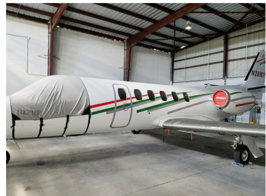
Cessna Citation II Cockpit Cover, Wing Covers