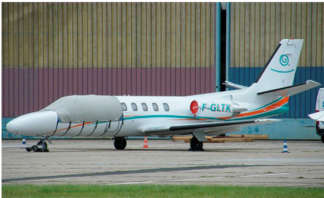
Citation Windshield Cover, to back of door

This cover type is made from Silver Acrylic Sunbrella canvas and is 100% lined with a soft and smooth microfiber. Bruce's Custom Covers developed this material combination especially for aircraft protection. The outer material is medium weight and treated for water resistance, UV resistance and anti-static buildup. The inner lining is a very soft and smooth microfiber to prevent scratching. The material is very reflective, and tests show that the cabin interior temperature can be reduced to near-ambient temperature on the hottest of days. It is water, ice and snow repellent, yet breathable to allow moisture to escape from between the cover and the aircraft surface.