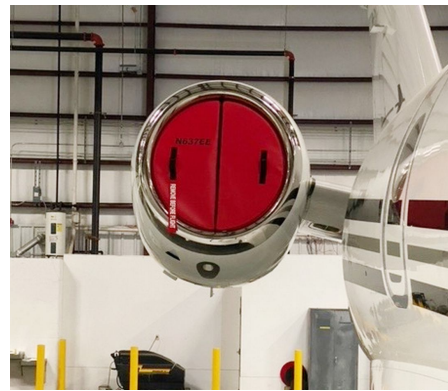
Embraer Legacy 500 Engine Inlet Plugs, folding type