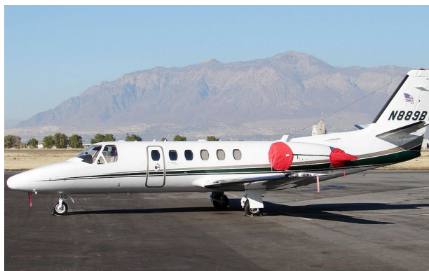
Citation Bravo Tri-Fold Engine Covers

The Cessna Citation II (550, 551, UC-35A, with JT15D) Intake Covers are designed to install easily yet be completely storable. A spring steel hoop is sewn into the hem of each cover, allowing them to be installed without climbing onto the wing or using a stepladder. To store the covers the spring steel hoop folds like a band-saw blade into three nesting rings. Each cover folds into a compact circular bundle which is stored in the included duffle bag, yet they unfold quickly for use. The Tri-Fold Ring cover is made of medium weight nylon which is available in a variety of colors to match the paint trim. Each cover set comes complete with installation and folding instructions. The aircraft's registration number can be silkscreened onto the cover for an extra charge.