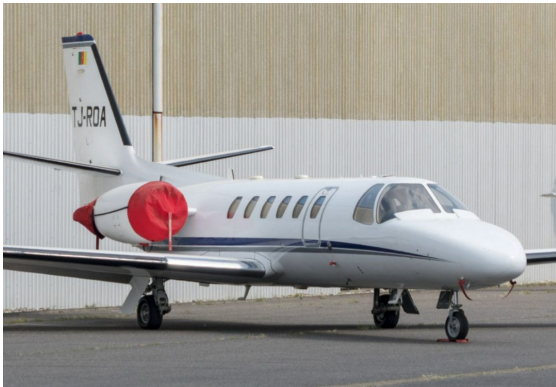
Cessna Citation II Bravo Engine Covers

The Cessna Citation II (550, 551, UC-35A, with JT15D) Intake Covers are designed to install easily yet be completely storable. A spring steel hoop is sewn into the hem of each cover, allowing them to be installed without climbing onto the wing or using a stepladder. To store the covers the spring steel hoop folds like a band-saw blade into three nesting rings. Each cover folds into a compact circular bundle which is stored in the included duffel bag, yet they unfold quickly for use. The Tri-Fold Ring cover is made of medium weight nylon which is available in a variety of colors to match the paint trim. Each cover set comes complete with installation and folding instructions. The aircraft's registration number can be silkscreened onto the cover for an extra charge.