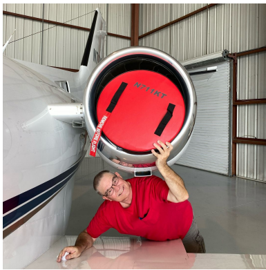
Citation II Engine Plugs

The Engine Inlet Plugs are custom fit for your Cessna Citation II (550, 551, UC-35A, with JT15D) intakes, made with heavy-duty vinyl material, and stuffed with a single block of sculpted urethane foam. Each plug has a zipper that allows the foam to be removed and dried if necessary. Engine plugs have 'remove before flight' streamers sewn onto the face of the plugs. Most plugs are imprinted with the aircraft registration number in black for an extra charge. Storage bag NOT included. Engine plugs may be inserted after flight when the engine is still warm. Engine Inlet Plugs are commonly referred to as Cowl Plugs, Intake Plugs, Cowl Blocks, Engine Blocks, and Engine Bungs.