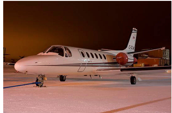
Cessna Citation 550 Engine Cover Set