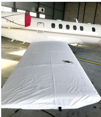
Cessna Citation CJ-4 Wing Covers, test fit cover

WINTER USE MATERIAL - Made with Solution-Dyed Polyester fabric, this option is intended for seasonal use to aid in deicing, rain mitigation, or for occasional travel. The material is lighter and more compact, but more susceptible to UV damage and may have a shorter useful life if used continuously outside than the all-year use material.