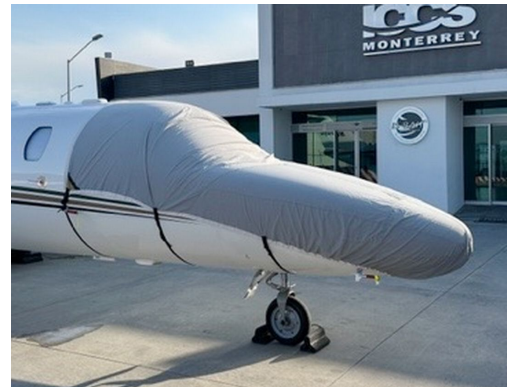
Cessna Citationjet 525B Travel Weight Cockpit/Nose Cover