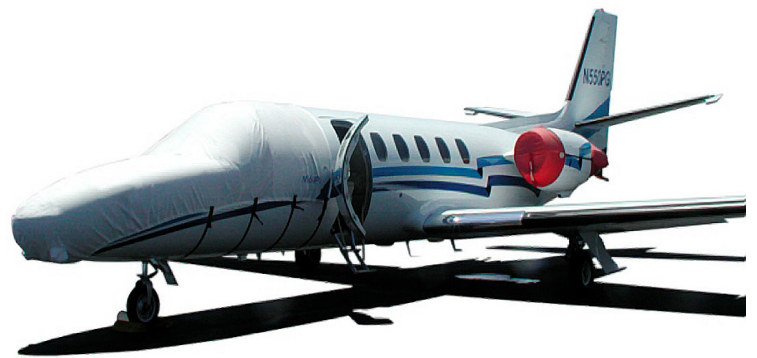
Cessna Citation Nose/Cockpit Cover, Engine Covers