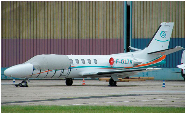
Citation Windshield Cover, to back of door

This cover type is made from Silver Acrylic Sunbrella canvas and is 100% lined with a soft and smooth microfiber. Bruce's Custom Covers developed this material combination especially for aircraft protection. The outer material is medium weight and treated for water resistance, UV resistance and anti-static buildup. The inner lining is a very soft and smooth microfiber to prevent scratching. The material is very reflective, and tests show that the cabin interior temperature can be reduced to near-ambient temperature on the hottest of days. It is water, ice and snow repellent, yet breathable to allow moisture to escape from between the cover and the aircraft surface.