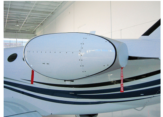
Cessna 551 Citation II SP Engine covers (with thrust reversers, smooth gen. inlet) Cessna 510 Mustang Bikini Type Engine Cover