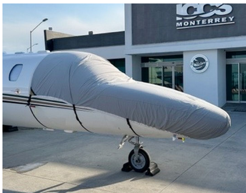
Cessna Citationjet 525B Travel Weight Cockpit/Nose Cover

This cover type is made from Silver Acrylic Sunbrella canvas and is 100% lined with a soft and smooth microfiber. Bruce's Custom Covers developed this material combination especially for aircraft protection. The outer material is medium weight and treated for water resistance, UV resistance and anti-static buildup. The inner lining is a very soft and smooth microfiber to prevent scratching. The material is very reflective, and tests show that the cabin interior temperature can be reduced to near-ambient temperature on the hottest of days. It is water, ice and snow repellent, yet breathable to allow moisture to escape from between the cover and the aircraft surface.