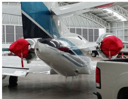
Cessna 551 Citation II SP Engine covers (with thrust reversers, smooth gen. inlet)