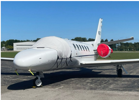
Cessna 550 Citation II