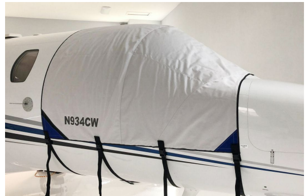
Cessna Citation M2 Cockpit Cover