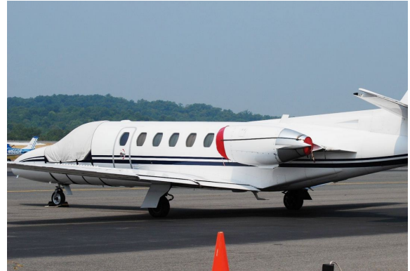
Cessna Citation S2 Cockpit Cover, Intake Covers & Exhaust Plugs