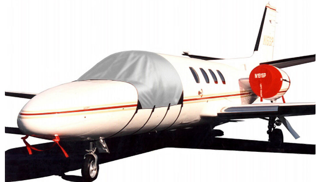
Cessna Citation Windshield Cover, Engine Cover set and Pitot Covers