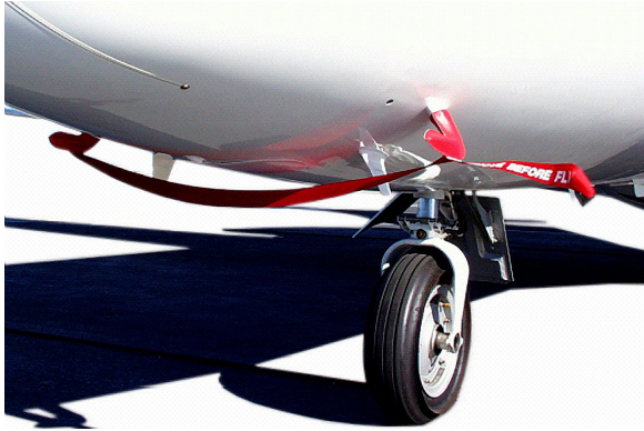
Cessna Citation I Pitot Covers

The Engine Inlet Plugs are custom fit for your Cessna Citationjet V Ultra (560) intakes, made with heavy-duty vinyl material, and stuffed with a single block of sculpted urethane foam. Each plug has a zipper that allows the foam to be removed and dried if necessary. Engine plugs have 'remove before flight' streamers sewn onto the face of the plugs. Most plugs are imprinted with the aircraft registration number in black for an extra charge. Storage bag NOT included. Engine plugs may be inserted after flight when the engine is still warm. Engine Inlet Plugs are commonly referred to as Cowl Plugs, Intake Plugs, Cowl Blocks, Engine Blocks, and Engine Bungs.