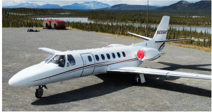
Cessna Citationjet V Ultra (560) Intake Plugs, With Pylon Plugs