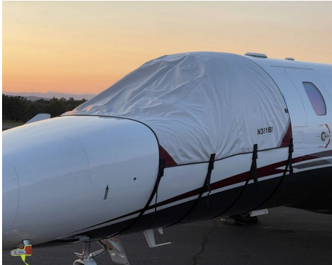
Cessna Citation Jet 525 Cockpit Cover

This cover type is made from Silver Acrylic Sunbrella canvas and is 100% lined with a soft and smooth microfiber. Bruce's Custom Covers developed this material combination especially for aircraft protection. The outer material is medium weight and treated for water resistance, UV resistance and anti-static buildup. The inner lining is a very soft and smooth microfiber to prevent scratching. The material is very reflective, and tests show that the cabin interior temperature can be reduced to near-ambient temperature on the hottest of days. It is water, ice and snow repellent, yet breathable to allow moisture to escape from between the cover and the aircraft surface.