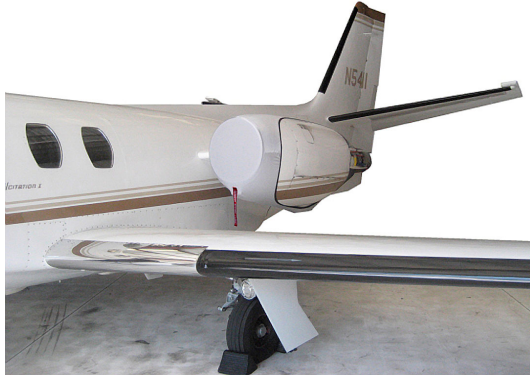
Cessna Citation "Bikini" Type Engine Covers: Extremely Light & Portable

The Cessna Citationjet V Ultra (560) Intake/Exhaust Plugs are custom fit for the intake and exhaust openings, made with heavy-duty vinyl material, and stuffed with a single block of sculpted urethane foam. Each plug has a zipper that allows the foam to be removed and dried if necessary. Engine plugs have 'remove before flight' streamers sewn onto the face of the plugs. Most plugs are imprinted with the aircraft registration number in black. Engine plugs may be inserted after flight when the engine is still warm. Engine Inlet Plugs are commonly referred to as Cowl Plugs, Intake Plugs, Cowl Blocks, Engine Blocks, and Engine Bungs.