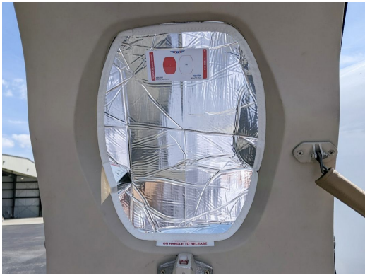
Citationjet Entrance Door Heatshield