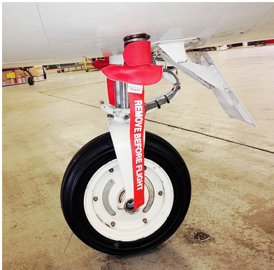
Rosemount Probe Cover

The Engine Inlet Plugs are custom fit for your Cessna Citationjet V Ultra & Encore Models intakes, made with heavy-duty vinyl material, and stuffed with a single block of sculpted urethane foam. Each plug has a zipper that allows the foam to be removed and dried if necessary. Engine plugs have 'remove before flight' streamers sewn onto the face of the plugs. Most plugs are imprinted with the aircraft registration number in black for an extra charge. Storage bag NOT included. Engine plugs may be inserted after flight when the engine is still warm. Engine Inlet Plugs are commonly referred to as Cowl Plugs, Intake Plugs, Cowl Blocks, Engine Blocks, and Engine Bungs.