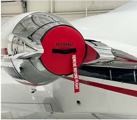
Cessna Citationjet V Ultra (560) Exhaust Plugs

The Engine Inlet Plugs are custom fit for your Cessna Citationjet V Ultra & Encore Models intakes, made with heavy-duty vinyl material, and stuffed with a single block of sculpted urethane foam. Each plug has a zipper that allows the foam to be removed and dried if necessary. Engine plugs have 'remove before flight' streamers sewn onto the face of the plugs. Most plugs are imprinted with the aircraft registration number in black for an extra charge. Storage bag NOT included. Engine plugs may be inserted after flight when the engine is still warm. Engine Inlet Plugs are commonly referred to as Cowl Plugs, Intake Plugs, Cowl Blocks, Engine Blocks, and Engine Bungs.