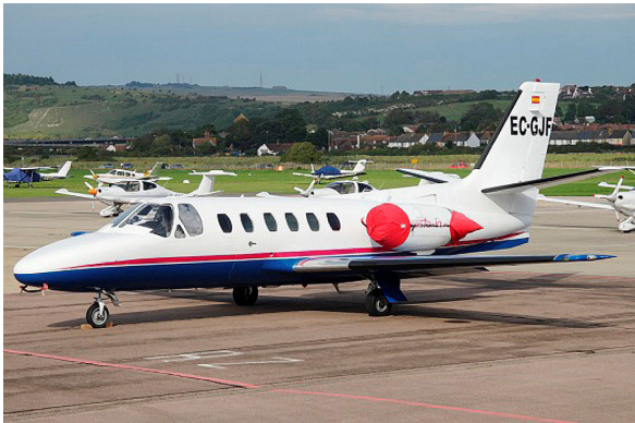
Cessna Citation II Engine Covers, Pitot Covers

The Cessna Citation II Bravo Intake/Exhaust Plugs are custom fit for the intake and exhaust openings, made with heavy-duty vinyl material, and stuffed with a single block of sculpted urethane foam. Each plug has a zipper that allows the foam to be removed and dried if necessary. Engine plugs have 'remove before flight' streamers sewn onto the face of the plugs. Most plugs are imprinted with the aircraft registration number in black. Engine plugs may be inserted after flight when the engine is still warm. Engine Inlet Plugs are commonly referred to as Cowl Plugs, Intake Plugs, Cowl Blocks, Engine Blocks, and Engine Bungs.