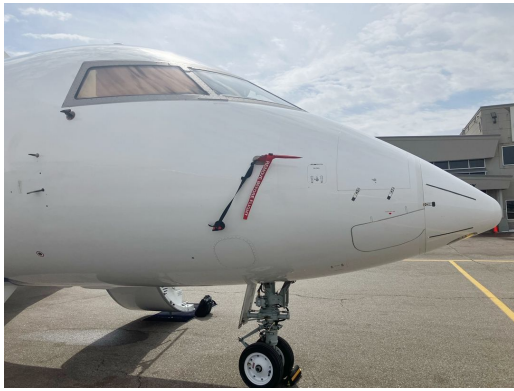
Challenger 650 Pitot & Ice Detector Covers