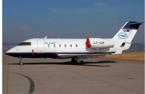
Challenger 600 Intake Covers