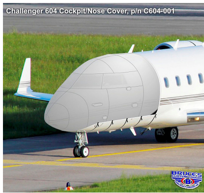
Challenger 601/604 Cockpit/Nose Cover, illustration