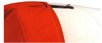
Alternate Intake Cover Design