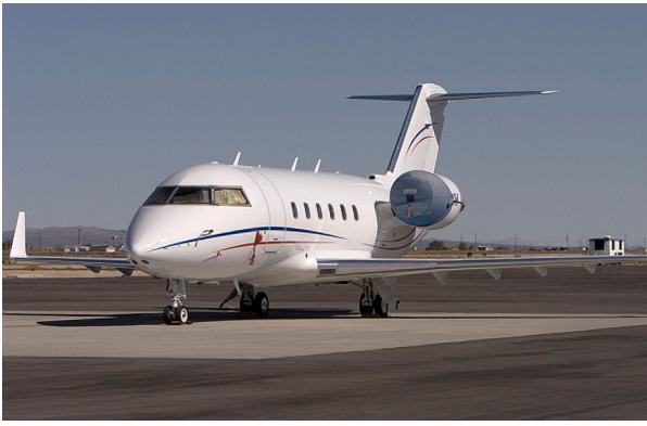
Challenger 604 Intake Covers, standard design