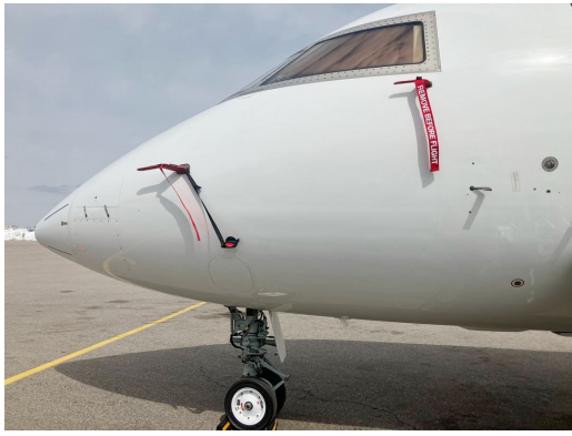
Challenger 650 Pitot & Ice Detector Covers