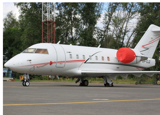
Canadair Challenger 601 Intake Covers