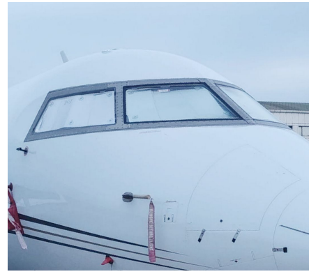
Challenger 604 Cockpit Heatshields (set of 4)