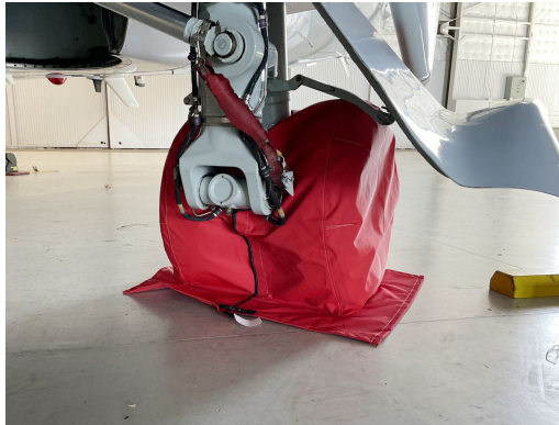
Canadair Challenger 605 Main Gear Tire Covers

ALL-YEAR USE MATERIAL - Made with Silver Acrylic Sunbrella canvas, the all-year use material is the best option for sun protection and cover longevity. This heavier more durable material is intended for all weather conditions, such as rain and snow or lots of sun.