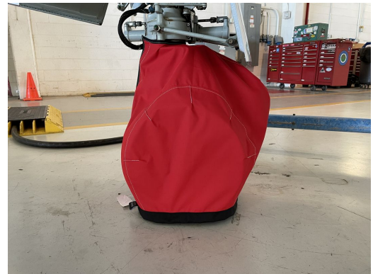
Canadair Challenger 605 Nose Gear Tire Cover