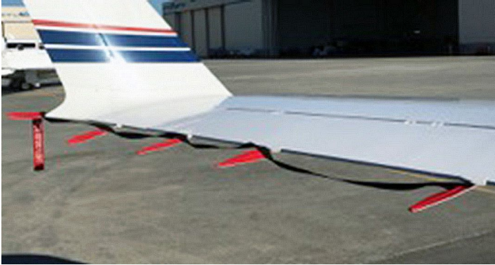
Static Wick Covers

with the aircraft registration number in black for an extra charge. Storage bag NOT included. Engine plugs may be inserted after flight when the engine is still warm. Engine Inlet Plugs are commonly referred to as Cowl Plugs, Intake Plugs, Cowl Blocks, Engine Blocks, and Engine Bungs.