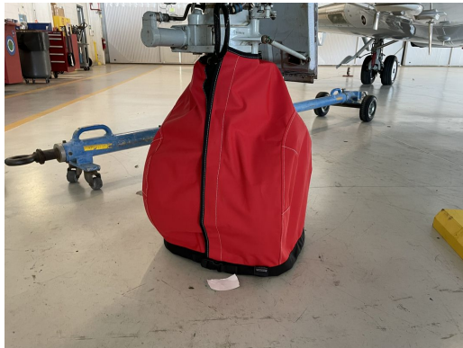
Canadair Challenger 605 Nose Gear Tire Cover