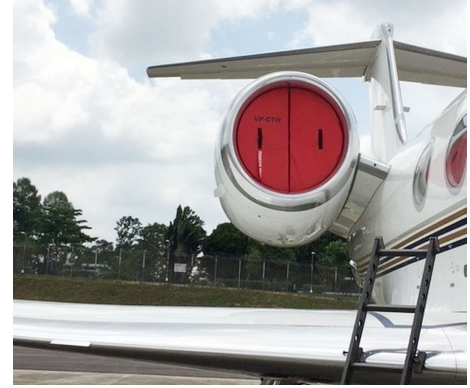
Grumman Gulfstream G450 Intake Plugs