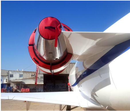
Canadair Challenger 604, 605, 650, 850 Exhaust Plugs

with the aircraft registration number in black for an extra charge. Storage bag NOT included. Engine plugs may be inserted after flight when the engine is still warm. Engine Inlet Plugs are commonly referred to as Cowl Plugs, Intake Plugs, Cowl Blocks, Engine Blocks, and Engine Bungs.