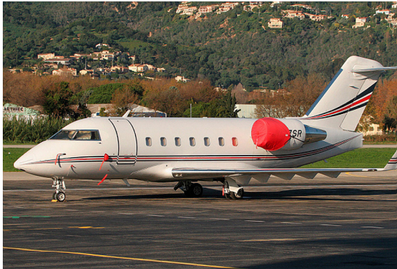
Challenger 601 Intake Covers, standard design

The Canadair Challenger 604, 605, 650, 850 Intake Covers are designed to install easily yet be completely storable. A spring steel hoop is sewn into the hem of each cover, allowing them to be installed without climbing onto the wing or using a stepladder. To store the covers the spring steel hoop folds like a band-saw blade into three nesting rings. Each cover folds into a compact circular bundle which is stored in the included duffle bag, yet they unfold quickly for use. The Tri-Fold Ring cover is made of medium weight nylon which is available in a variety of colors to match the paint trim. Each cover set comes complete with installation and folding instructions. The aircraft's registration number can be silkscreened onto the cover for an extra charge.