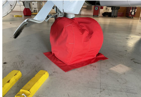
Canadair Challenger 605 Main Gear Tire Covers