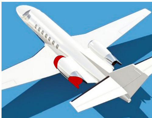
Cessna Citation II with TR's Exhaust Cover Illustration