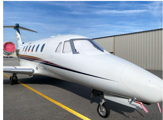
Cessna 650 Cockpit Heatshields (set of 6)