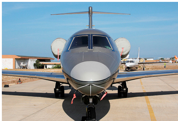
Citation III 650 Engine Covers Set