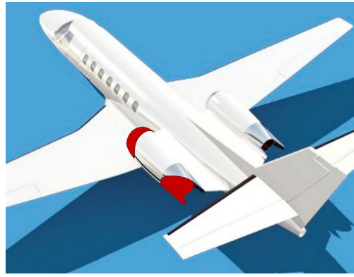
Cessna Citation II with TR's Exhaust Cover Illustration