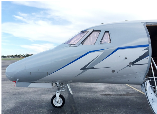
Cessna Citation 650 Cockpit HeataShields

Cockpit Heatshields are interior sunshades for the aircraft's cockpit. The product is a unique composite of closed-cell foam with a silver mylar finish. The semi-rigid design is stiff enough to stand inside the window framing. The set folds up flat and is easily stored in the included storage sleeve. Some designs may require velcro and suction cups. Our Heatshields for jets are offered white side out because some aircraft manufacturers have issued advisories against reflective window inserts due to potential heat damage. A Heatshield is an excellent short-term remedy for cockpit overheating, but an external fabric cover is more effective for long-term protection.