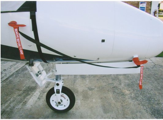
Citation XL Pitot Covers