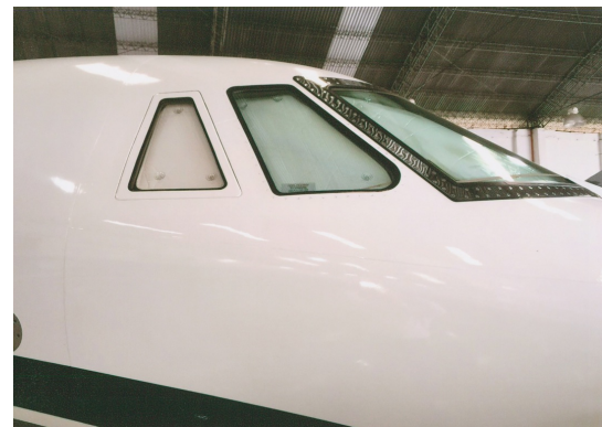
Citation XL Cockpit HeatShields