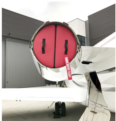
Cessna Citation 680 Exhaust Plugs, folding type

The Engine Inlet Plugs are custom fit for your Cessna Citation Latitude (680A) intakes, made with heavy-duty vinyl material, and stuffed with a single block of sculpted urethane foam. Each plug has a zipper that allows the foam to be removed and dried if necessary. Engine plugs have 'remove before flight' streamers sewn onto the face of the plugs. Most plugs are imprinted with the aircraft registration number in black for an extra charge. Storage bag NOT included. Engine plugs may be inserted after flight when the engine is still warm. Engine Inlet Plugs are commonly referred to as Cowl Plugs, Intake Plugs, Cowl Blocks, Engine Blocks, and Engine Bungs.