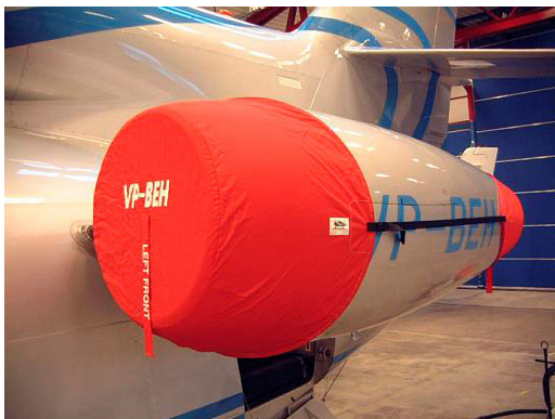
Falcon 900 Sovereign Engine Covers

The Cessna Citation Latitude (680A) Intake/Exhaust Plugs are custom fit for the intake and exhaust openings, made with heavy-duty vinyl material, and stuffed with a single block of sculpted urethane foam. Each plug has a zipper that allows the foam to be removed and dried if necessary. Engine plugs have 'remove before flight' streamers sewn onto the face of the plugs. Most plugs are imprinted with the aircraft registration number in black. Engine plugs may be inserted after flight when the engine is still warm. Engine Inlet Plugs are commonly referred to as Cowl Plugs, Intake Plugs, Cowl Blocks, Engine Blocks, and Engine Bungs.