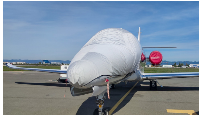
Cessna Citation Latitude (680A) Cockpit/Nose Cover, Doesn't Cover Pitot Tubes