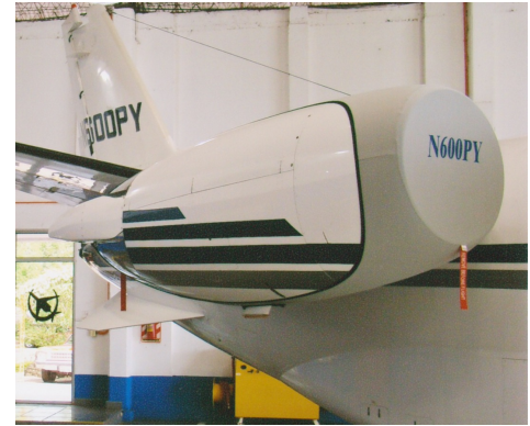
Citation XL Bikini Style Engine Covers