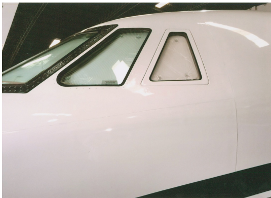
Citation XL Cockpit HeatShields

Cockpit Heatshields are interior sunshades for the aircraft's cockpit. The product is a unique composite of closed-cell foam with a silver mylar finish. The semi-rigid design is stiff enough to stand inside the window framing. The set folds up flat and is easily stored in the included storage sleeve. Some designs may require velcro and suction cups. Our Heatshields for jets are offered white side out because some aircraft manufacturers have issued advisories against reflective window inserts due to potential heat damage. A Heatshield is an excellent short-term remedy for cockpit overheating, but an external fabric cover is more effective for long-term protection.