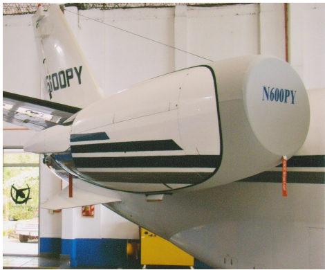
Citation XL Bikini Style Engine Covers

which is stored in the included duffle bag, yet they unfold quickly for use. The Tri-Fold Ring cover is made of medium weight nylon which is available in a variety of colors to match the paint trim. Each cover set comes complete with installation and folding instructions. The aircraft's registration number can be silkscreened onto the cover for an extra charge.