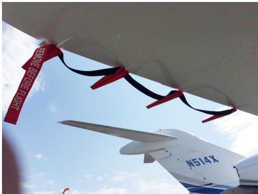
Citation X Static Wick Protectors