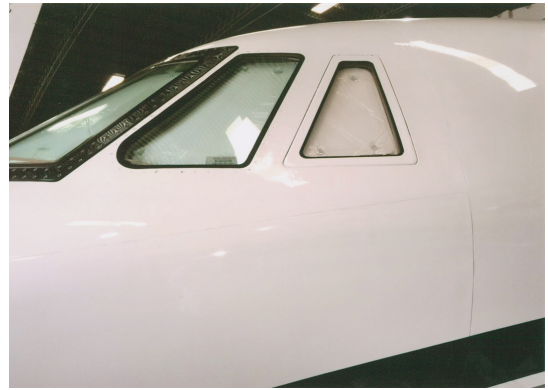
Citation XL Cockpit HeatShields