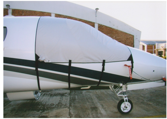
Citation XL Cockpit Cover