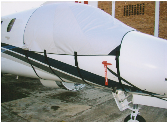
Citation XL Cockpit Cover