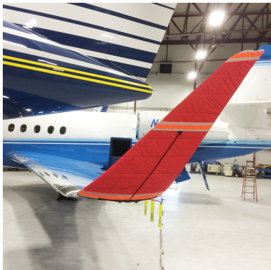
Falcon 2000 Winglet Pad

ALL-YEAR USE MATERIAL - Made with Silver Acrylic Sunbrella canvas, the all-year use material is the best option for sun protection and cover longevity. This heavier more durable material is intended for all weather conditions, such as rain and snow or lots of sun.