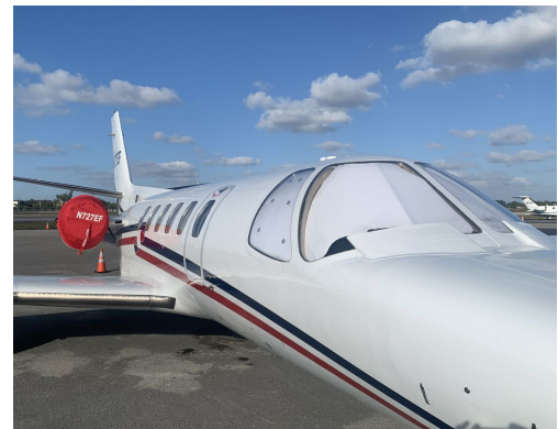
Cessna Citation S550