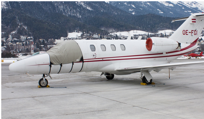
Cessna Citationjet CJ1 Cockpit Cover

This cover type is made from Silver Acrylic Sunbrella canvas and is 100% lined with a soft and smooth microfiber. Bruce's Custom Covers developed this material combination especially for aircraft protection. The outer material is medium weight and treated for water resistance, UV resistance and anti-static buildup. The inner lining is a very soft and smooth microfiber to prevent scratching. The material is very reflective, and tests show that the cabin interior temperature can be reduced to near-ambient temperature on the hottest of days. It is water, ice and snow repellent, yet breathable to allow moisture to escape from between the cover and the aircraft surface.