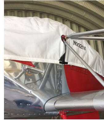
Callair A-2 Canopy Cover