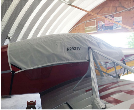
Callair A-2 Canopy Cover

Canopy Covers are commonly referred to as Cabin Covers, Fuselage Covers, Canvas Covers, Canopy Caps, etc.