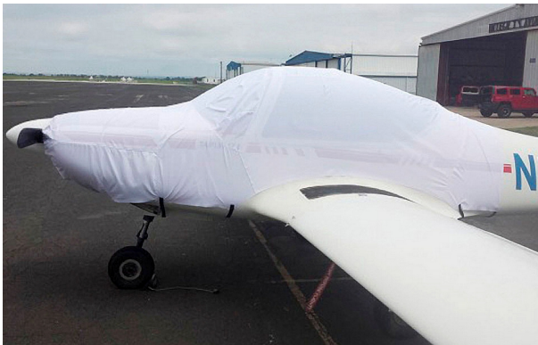
Taifun 17E Canopy/Engine Cover, test fit cover