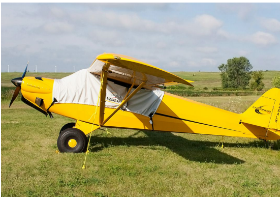
Cub Crafters Canopy Cover

This cover type is made from Silver Acrylic Sunbrella canvas and is 100% lined with a soft and smooth microfiber. Bruce's Custom Covers developed this material combination especially for aircraft protection. The outer material is medium weight and treated for water resistance, UV resistance and anti-static buildup. The inner lining is a very soft and smooth microfiber to prevent scratching. The material is very reflective, and tests show that the cabin interior temperature can be reduced to near-ambient temperature on the hottest of days. It is water, ice and snow repellent, yet breathable to allow moisture to escape from between the cover and the aircraft surface.