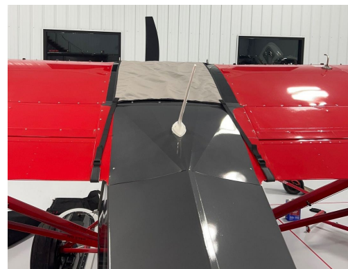
Cub Crafters CC11-004: WINDSHIELD/SKYLIGHT COVER