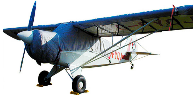
Aviat Husky Insulated Engine Cover, Canopy & Wing Covers