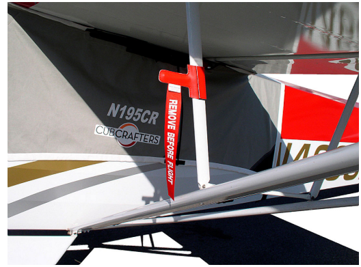
Cub Crafters Sport Cub Pitot Cover