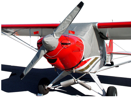
Cub Crafters Sport Cub Prop Cover & Engine Plugs