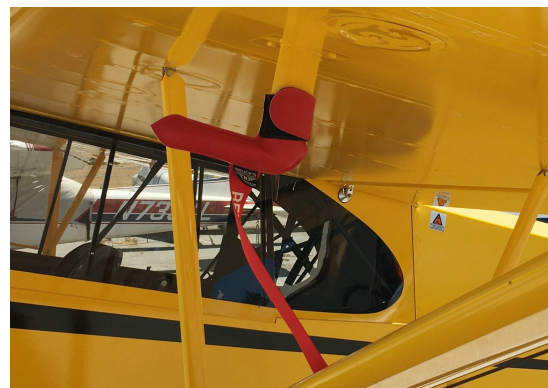
Cub Crafters CC-11 Carbon Cub Pitot Cover