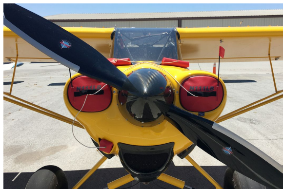
Cub Crafters CC-11 Carbon Cub Engine Plugs