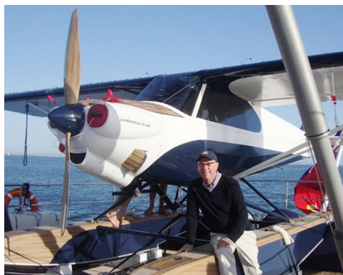
Cub Crafters CC-11 Engine Plugs

Engine Inlet Plugs are custom fit for your CubCrafters CC-11, Sport Cub S2, & Carbon Cub intakes, made with heavy-duty vinyl material, and stuffed with a single block of sculpted urethane foam. Each plug has a zipper that allows the foam to be removed and dried if necessary. Engine plugs have warning flags that are visible from the cockpit or 'remove before flight' streamers sewn onto the face of the plugs. Most plugs are imprinted with the aircraft registration number in black for an extra charge. Storage bag NOT included. Engine plugs may be inserted after flight when the engine is still warm. Engine Inlet Plugs are commonly referred to as Cowl Plugs, Intake Plugs, Cowl Blocks, Engine Blocks, and Engine Bungs.