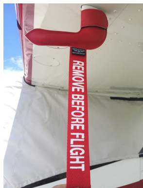
Cessna A185F Pitot Cover

Engine Inlet Plugs are custom fit for your CubCrafters CC-11, Sport Cub S2, & Carbon Cub intakes, made with heavy-duty vinyl material, and stuffed with a single block of sculpted urethane foam. Each plug has a zipper that allows the foam to be removed and dried if necessary. Engine plugs have warning flags that are visible from the cockpit or 'remove before flight' streamers sewn onto the face of the plugs. Most plugs are imprinted with the aircraft registration number in black for an extra charge. Storage bag NOT included. Engine plugs may be inserted after flight when the engine is still warm. Engine Inlet Plugs are commonly referred to as Cowl Plugs, Intake Plugs, Cowl Blocks, Engine Blocks, and Engine Bungs.