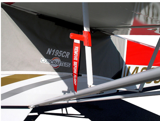
Cub Crafters Sport Cub Pitot Cover

This cover type is made from Silver Acrylic Sunbrella canvas and is 100% lined with a soft and smooth microfiber. Bruce's Custom Covers developed this material combination especially for aircraft protection. The outer material is medium weight and treated for water resistance, UV resistance and anti-static buildup. The inner lining is a very soft and smooth microfiber to prevent scratching. The material is very reflective, and tests show that the cabin interior temperature can be reduced to near-ambient temperature on the hottest of days. It is water, ice and snow repellent, yet breathable to allow moisture to escape from between the cover and the aircraft surface.