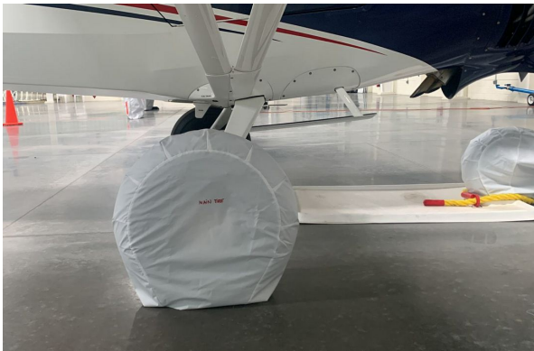
Cub Crafters Tire Covers, tricycle gear, test fit covers

ALL-YEAR USE MATERIAL - Made with Silver Acrylic Sunbrella canvas, the all-year use material is the best option for sun protection and cover longevity. This heavier more durable material is intended for all weather conditions, such as rain and snow or lots of sun.