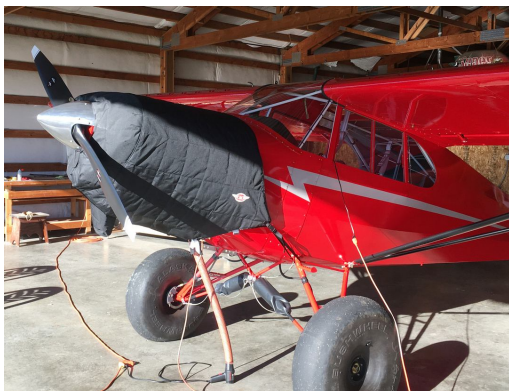
Piper PA-12 Insulated Engine Cover