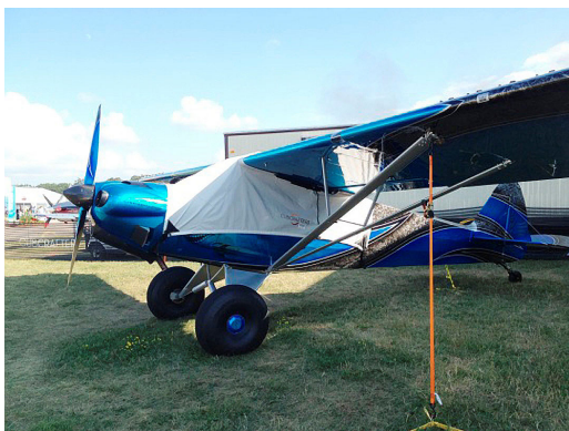
Cub Crafters Carbon Cub Canopy Cover

This cover type is made from Silver Acrylic Sunbrella canvas and is 100% lined with a soft and smooth microfiber. Bruce's Custom Covers developed this material combination especially for aircraft protection. The outer material is medium weight and treated for water resistance, UV resistance and anti-static buildup. The inner lining is a very soft and smooth microfiber to prevent scratching. The material is very reflective, and tests show that the cabin interior temperature can be reduced to near-ambient temperature on the hottest of days. It is water, ice and snow repellent, yet breathable to allow moisture to escape from between the cover and the aircraft surface.