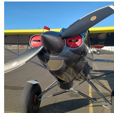
CubCrafters FX-3 Engine Inlet Plugs