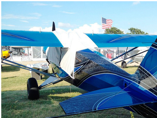
Cub Crafters Carbon Cub Canopy Cover

This cover type is made from Silver Acrylic Sunbrella canvas and is 100% lined with a soft and smooth microfiber. Bruce's Custom Covers developed this material combination especially for aircraft protection. The outer material is medium weight and treated for water resistance, UV resistance and anti-static buildup. The inner lining is a very soft and smooth microfiber to prevent scratching. The material is very reflective, and tests show that the cabin interior temperature can be reduced to near-ambient temperature on the hottest of days. It is water, ice and snow repellent, yet breathable to allow moisture to escape from between the cover and the aircraft surface.