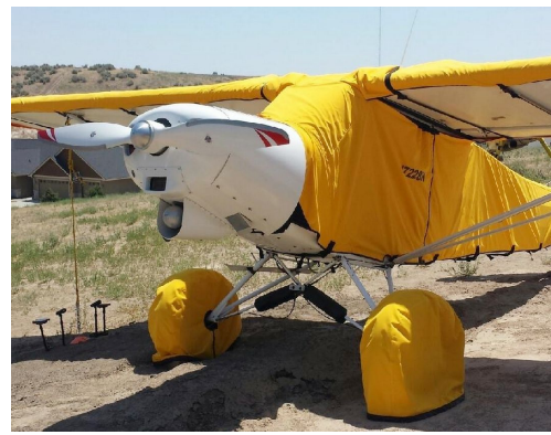
Piper PA-18 Super Cub Extended Canopy Cover, Wing & Tire Covers