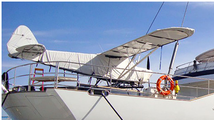
Piper PA-18 Super Cub Complete Cover set

WINTER USE MATERIAL - Made with Solution-Dyed Polyester fabric, this option is intended for seasonal use to aid in deicing, rain mitigation, or for occasional travel. The material is lighter and more compact, but more susceptible to UV damage and may have a shorter useful life if used continuously outside than the all-year use material.