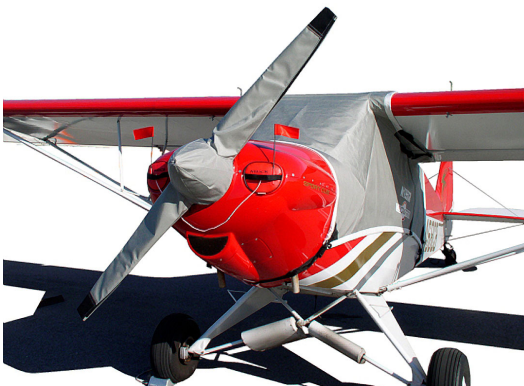
Cub Crafters Sport Cub Prop Cover & Engine Plugs

Engine Inlet Plugs are custom fit for your CubCrafters CC-18, 19, 20, Top Cub, CCK-1865, CC-19 X-Cub, CCX-2000, EX-3, FX-3 intakes, made with heavy-duty vinyl material, and stuffed with a single block of sculpted urethane foam. Each plug has a zipper that allows the foam to be removed and dried if necessary. Engine plugs have warning flags that are visible from the cockpit or 'remove before flight' streamers sewn onto the face of the plugs. Most plugs are imprinted with the aircraft registration number in black for an extra charge. Storage bag NOT included. Engine plugs may be inserted after flight when the engine is still warm. Engine Inlet Plugs are commonly referred to as Cowl Plugs, Intake Plugs, Cowl Blocks, Engine Blocks, and Engine Bungs.