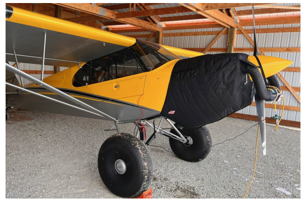
CubCrafters CCX-2000 Insulated Engine Cover