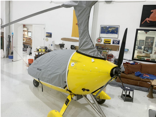
Autogyro Calidus Gyrocopter Canopy/Nose & Rotor Hub/Mast Cover