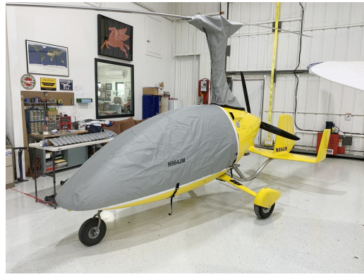
Autogyro Calidus Canopy/Nose Cover, test fit cover