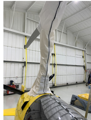
Calidus Gyrocopter Rotor Mast Cover, test fit cover