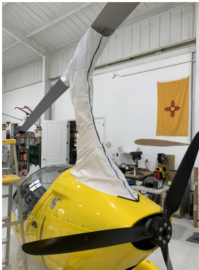
Calidus Gyrocopter Rotor Mast Cover, test fit cover

Rotor Hub Covers overlaps with the Blade Covers to ensure complete protection for the entire main rotor system. Designed like a jacket with sleeves and no collar, the rotor hub cover fastens together below each blade with Delrin buckles. The Rotor Hub Cover is normally made from Solution-Dyed Polyester.