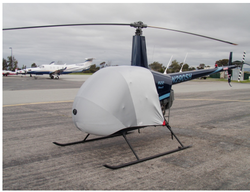
Robinson R-22 Light Weight Travel Cover