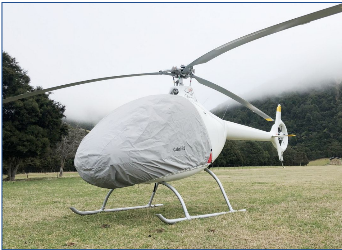
Guimbal Cabri CG2 Bubble Cover, light weight travel type