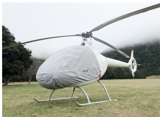
Guimbal Cabri CG2 Bubble Cover, light weight travel type