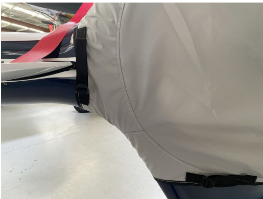
Guimbal Cabri G2 Tailfan Housing Fenestron Cover