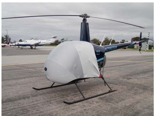
Robinson R-22 Light Weight Travel Cover

Travel Covers are made with Silver Solution-Dyed Polyester fabric and fully lined over the entire cover. The material is lightweight and more compact for easy storage in the aircraft. The polyester material is water resistant, but only intended for occasional use outside. We also have an ultra lightweight material available for fitted hangar dust covers. For daily outdoor use, the non-travel Sunbrella Cover is the best choice.