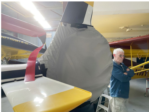
Guimbal Cabri G2 Tailfan Housing Fenestron Cover

WINTER USE MATERIAL - Made with Solution-Dyed Polyester fabric, this option is intended for seasonal use to aid in deicing, rain mitigation, or for occasional travel. The material is lighter and more compact, but more susceptible to UV damage and may have a shorter useful life if used continuously outside than the all-year use material.