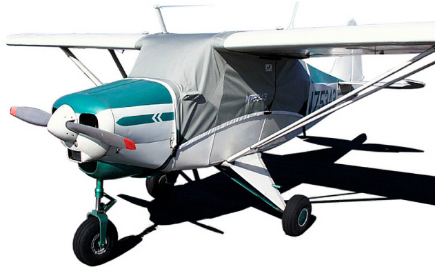
Tri-Pacer Over-the-Top Canopy Cover

lightweight and more compact for easy stowage in the aircraft. The polyester material is water resistant, but only intended for occasional use outside. We also have an ultra lightweight material available for fitted hangar dust covers. For daily outdoor use, the non-travel Sunbrella Cover is the best choice.