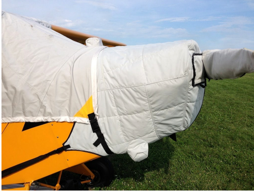
Piper J-3 Cub Insulated Engine Cover with added Pre-heater Access Flaps

Insulated Covers Material - A special composite material of solution-dyed polyester, 3M Thinsulate insulation, and soft nylon interior fabric. Our insulated covers are designed to complement an engine preheater and help retain heat in the engine compartment after shutdown. If you operate your aircraft in cold-weather, these covers will help prevent engine wear and tear.