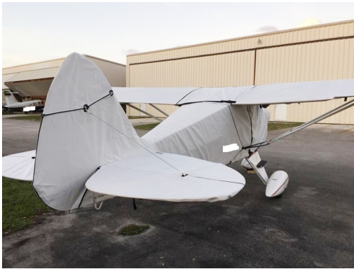
Piper PA-20 Complete Cover Set

WINTER USE MATERIAL - Made with Solution-Dyed Polyester fabric, this option is intended for seasonal use to aid in deicing, rain mitigation, or for occasional travel. The material is lighter and more compact, but more susceptible to UV damage and may have a shorter useful life if used continuously outside than the all-year use material.