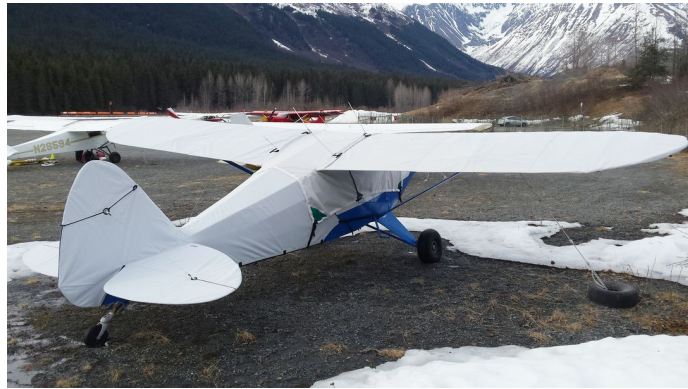
Piper Pacer PA-22 Over-Top Canopy Cover, Wing and Empennage Covers