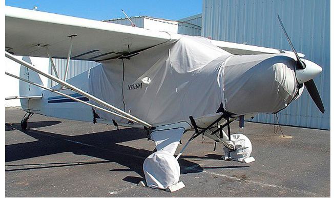
Piper PA-12 Extended Canopy, Engine & Landing Gear Covers